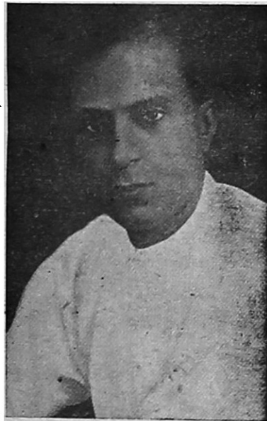
PANDIT JAWAHARLAL NEHRU

W E learn from a Reuter's message from Allahabad that Pandit Jawaharlal Nehru has been re-elected President of the Indian National Congress which meets during the Christmas week at Faizpur.