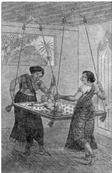
A Hindoo Cradle .