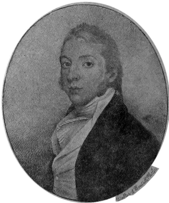
Thomas Twining, 1776 - 1861.