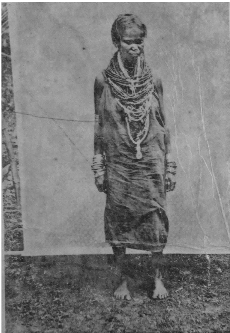
Woman in the Costume of the Vakkal Castes of North Kanara.