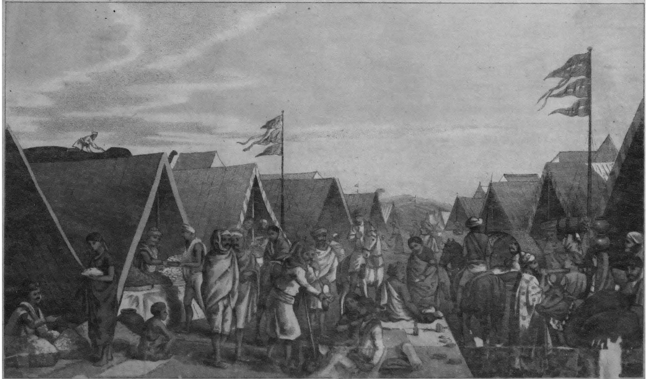
BAZAAR IN THE SCINDIA'S CAMP