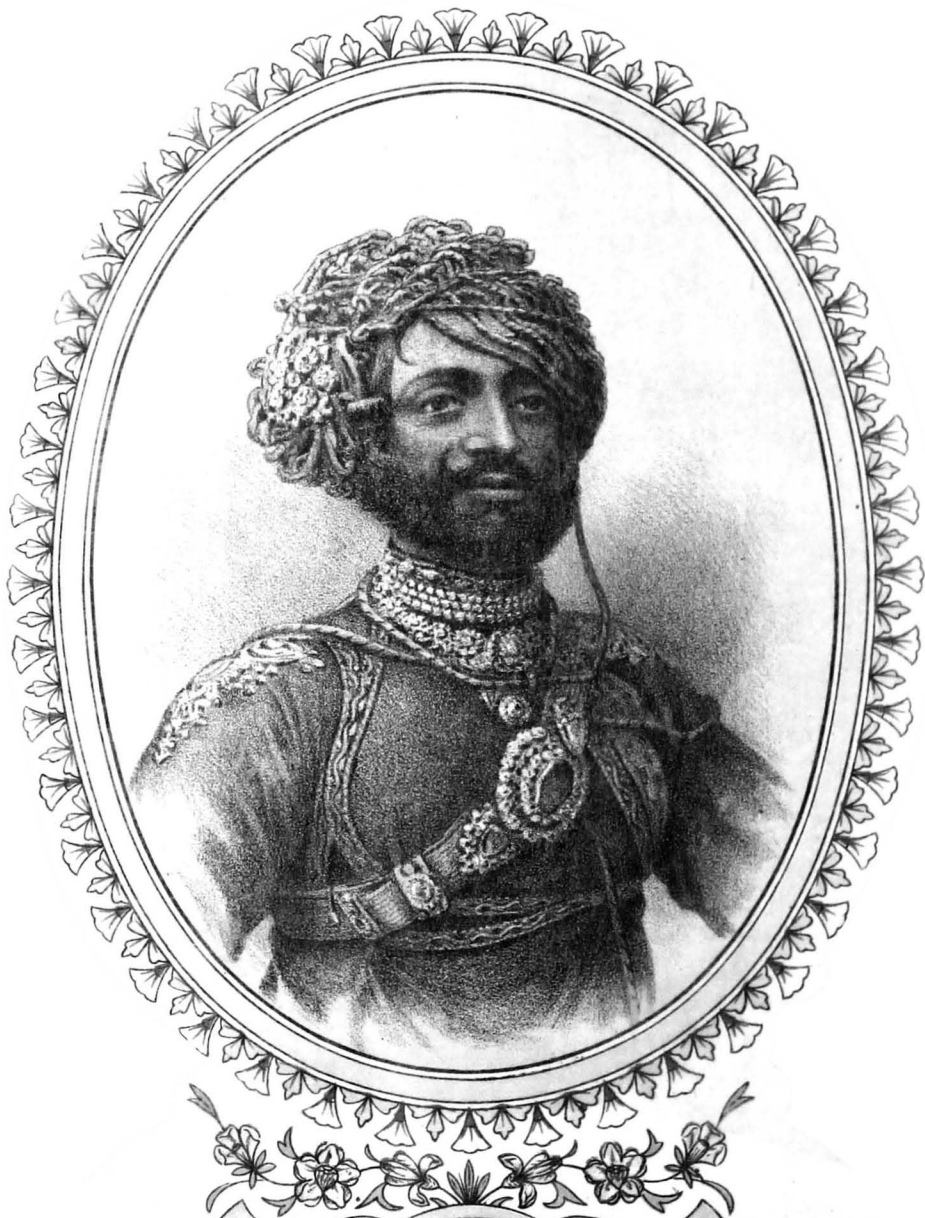
H. H. THE NOWAB OF JÚNÁGADH.