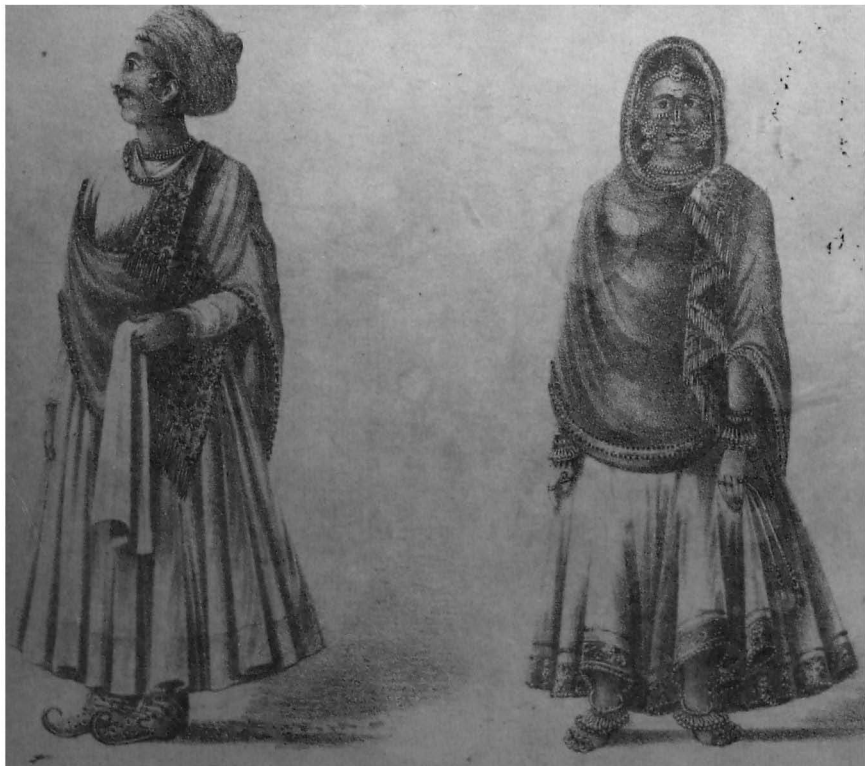
HINDOOS OF HIGH RANK IN FULL WINTER DRESS.

London, 1838 W.B. Allen & Co. Threadneedle Street ©. Scoville 1838.