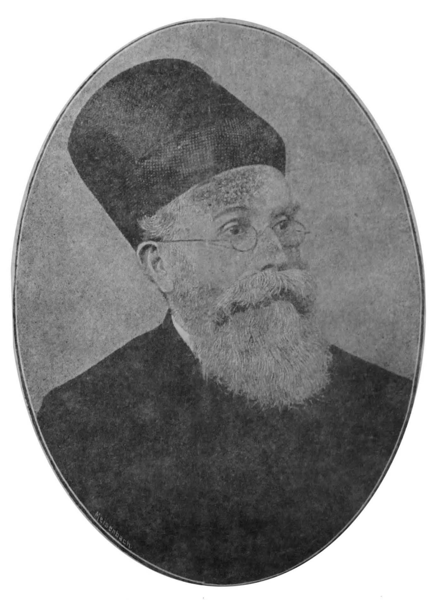
THE MONOURABLE DADABHAI NAOROJI,