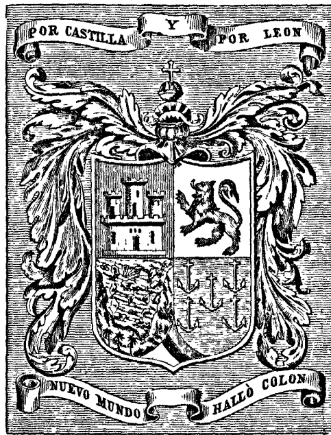
ARMS OF COLUMBUS. .

enterprise during years of weary and almost hopeless solicitation. It is more than probable that at the time of his visiting Thule the tradition concerning Vinland had long been forgotten, and the sagas had been consigned to the dust of libraries and archives, thence to be drawn forth by antiquarian research in after ages, when his own discoveries should have cast back a light to illuminate their obscurity.