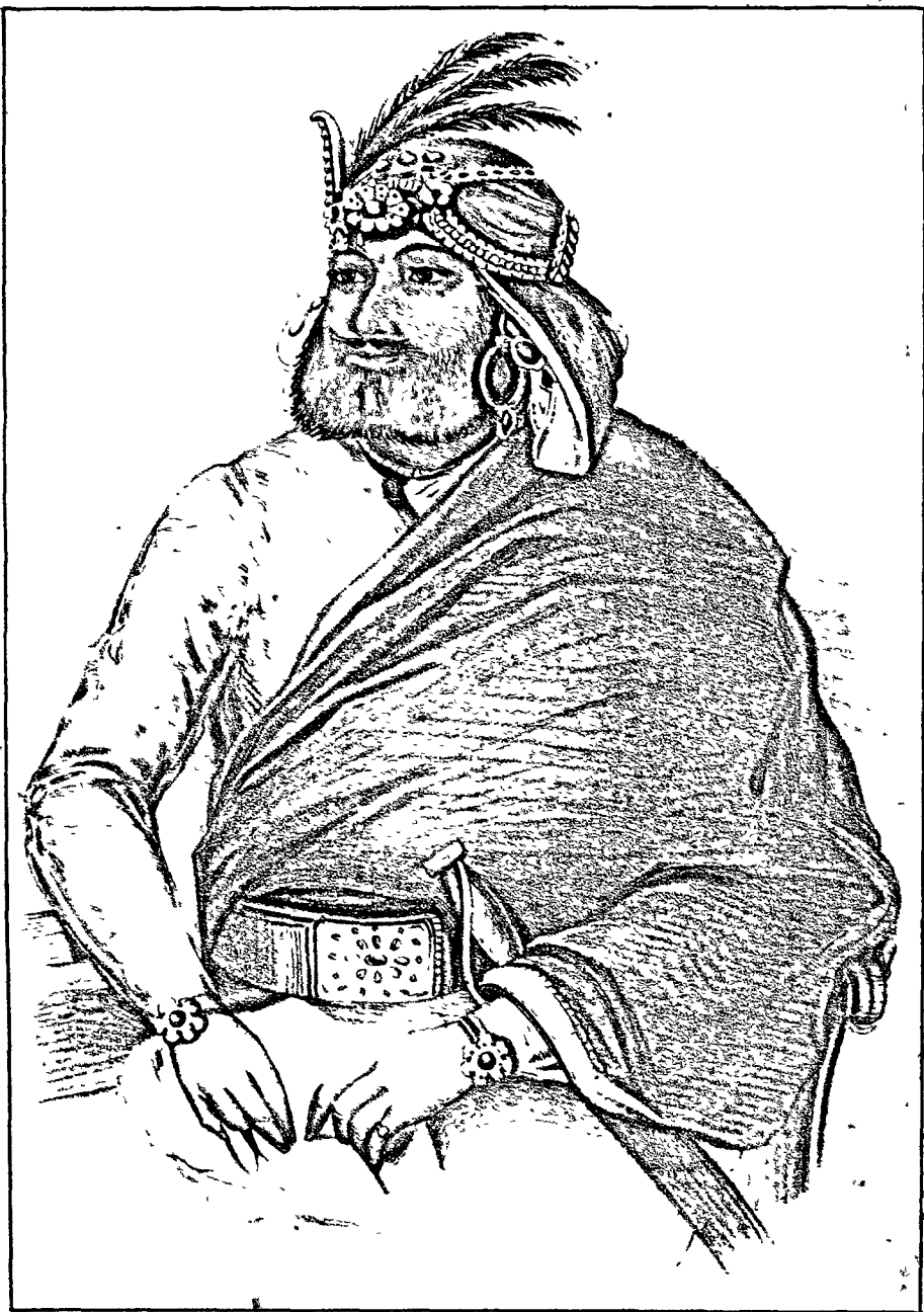
THE LATE MAHARAJAH SHER SINGH