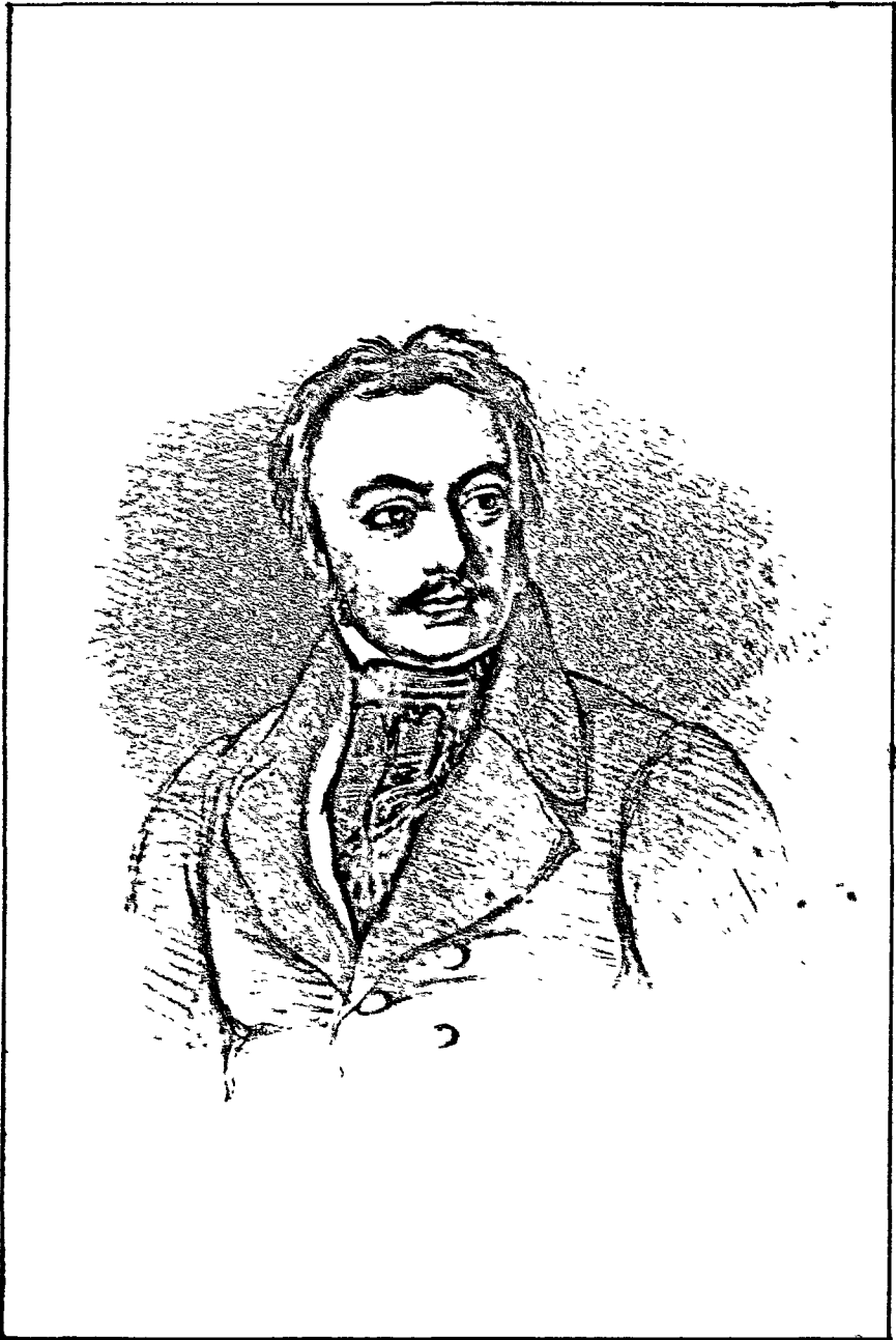
SIR HENRY POTTINGER G.C.B.