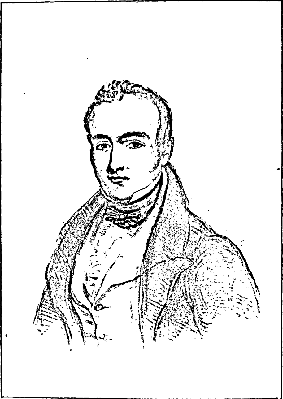
THE LATE SIR WILLIAM HAY MACNAGHTEN BT