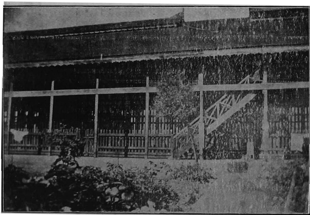
The wooden cage of Mandalay where Lok. Tilak was imprisoned for Six years.