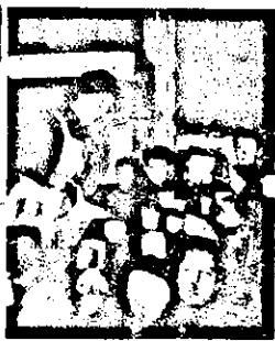
Feeding Poor Children.

including 106 Children's Homes, 26 Crèches, 19 Industrial Schools, and 1,025 Day Schools. In addition it has 175 Slum Posts, and 1,547 Social Institutions (including Hospitals), which are devoted to rescue and welfare work among the needy of all ages.