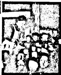
Feeding Poor Children.

has a wide range of agencies specially devoted to Child Care and Protection