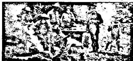
Life-saving Scouts in Sweden.

T HROUGH these, and its 15,146 Corps, The Salvation Army is carrying out a great work for the causes of Humanity and Righteousness in 82 countries and colonies.