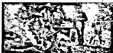
Life-saving Scouts in Sweden.

THROUGH these, and its 15,146 Corps, The Salvation Army is carrying out a great work for the causes of Humanity and Righteousness in 82 countries and colonies.