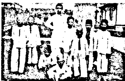
Leprosy Boys in Sumatra.

including 106 Children's Homes, 26 Crèches, 19 Industrial Schools, and 1,025 Day Schools. In addition it has 175 Slum Posts, and 1,547 Social Institutions (including Hospitals), which are devoted to rescue and welfare work among the needy of all ages.