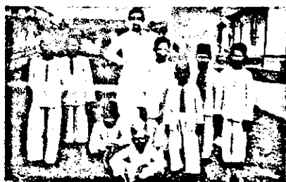
Leprosy Boys in Sumatra.