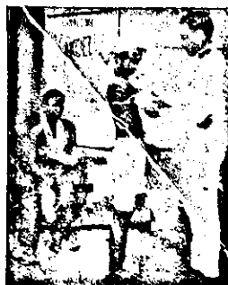
Dressing the arm of a French boy.

T HROUGH these, and its 15,146 Corps, The Salvation Army is carrying out a great work for the causes of Humanity and Righteousness in 82 countries and colonies.