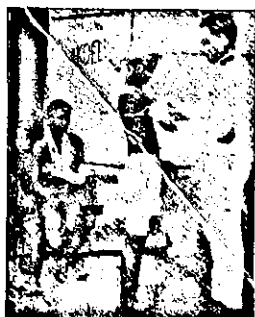
Dressing the arm of a Japanese boy.

THROUGH these, and its 15,146 Corps, The Salvation Army is carrying out a great work for the causes of Humanity and Righteousness in 82 countries and colonies.