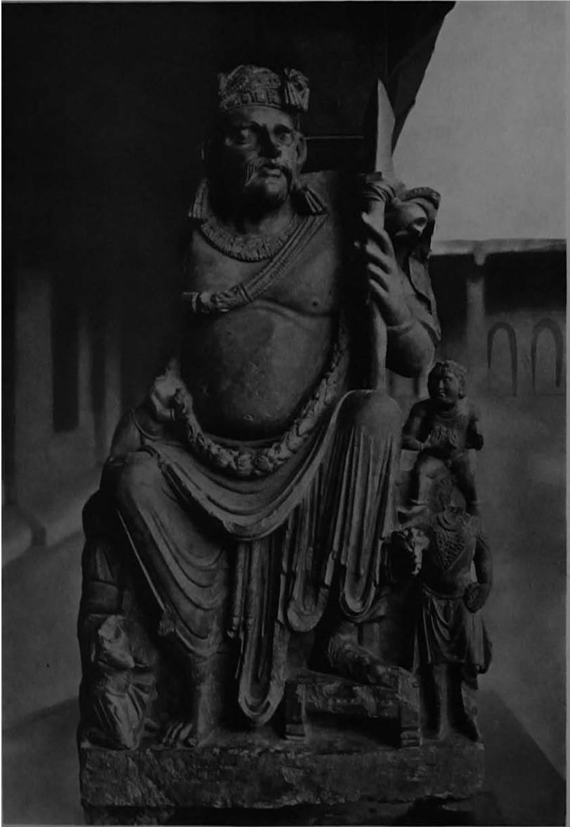
KUVERA. (FROM AN INDO-GREEK SCULPTURE)