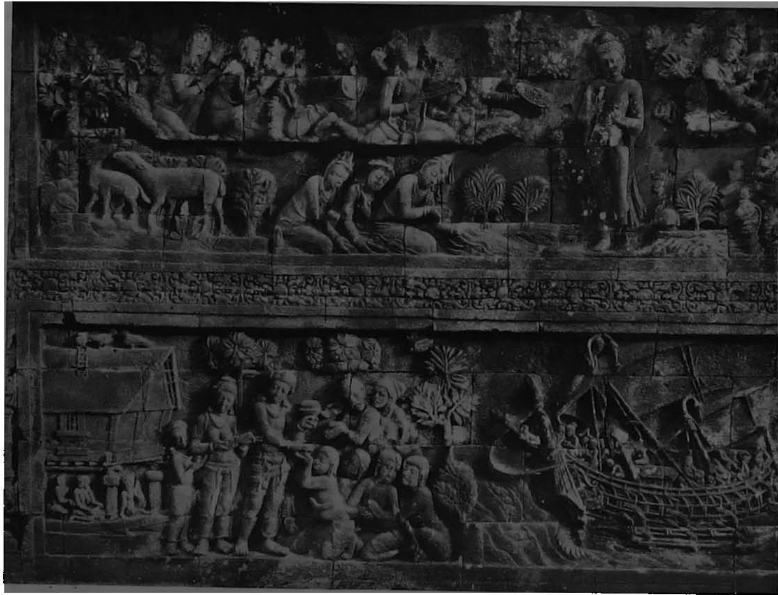
•AN ANCIENT HINDU SHIP (Borobudur Sculptures)