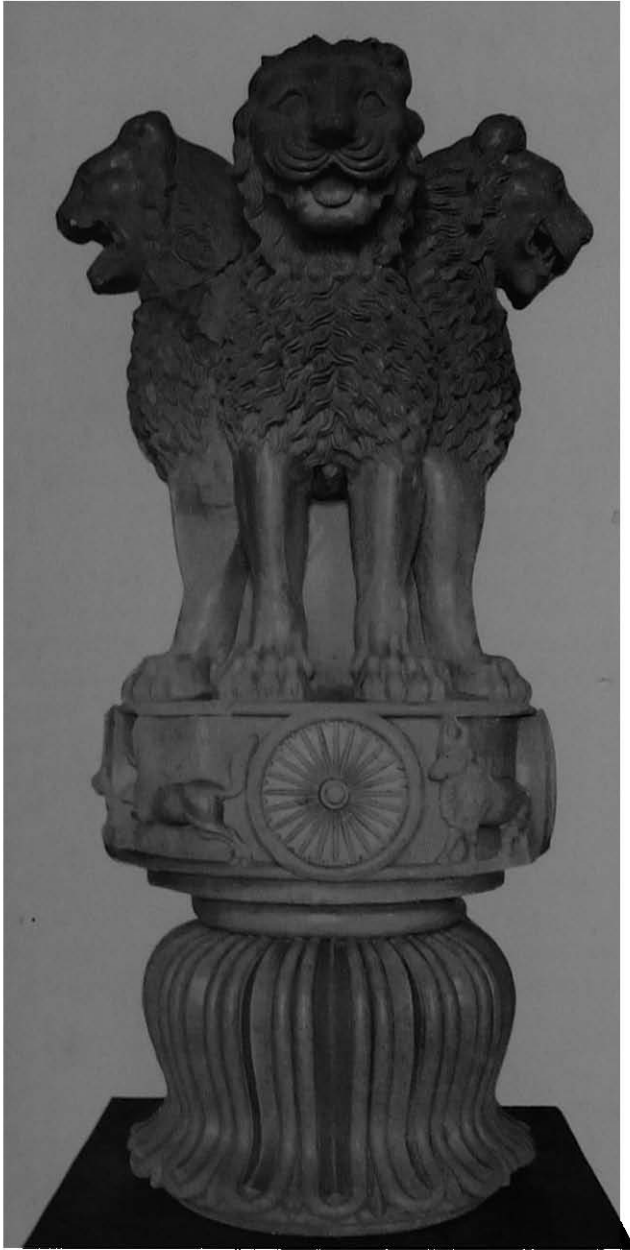
AŠOKA PILLAR (INDO-PERSIAN)