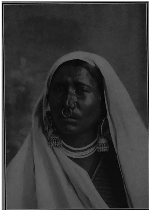
A "Gipsy" Domin