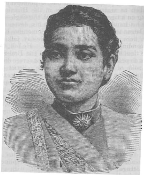
THE MAHARANI OF KUCH BEHAR.

following the Conservative, but the majority the Progressive pattern.