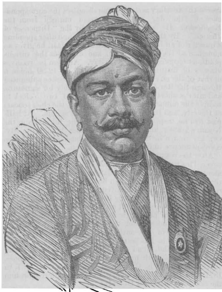
20. RAJA SIR TANJORE MADHAVA ROW, K.C.S.I.

Sir Tanjore Madhava Row was a descendant of one of those Mahratta Brahman families who settled in Tanjore at the time of its subjugation by the Mahrattas in the 16th