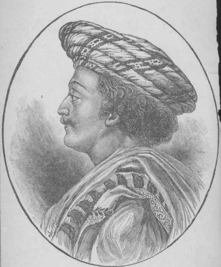
RAJA RAMMOHUN ROY.