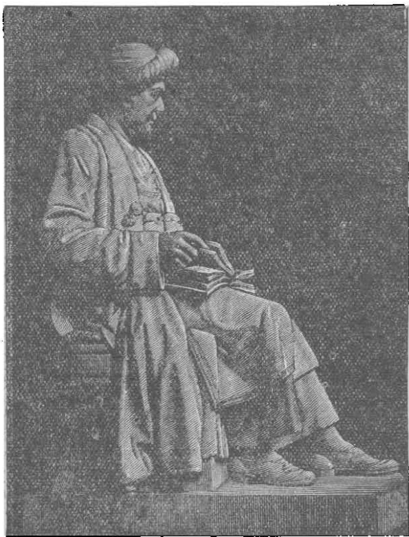
Statue in the Senate House, Calcutta.