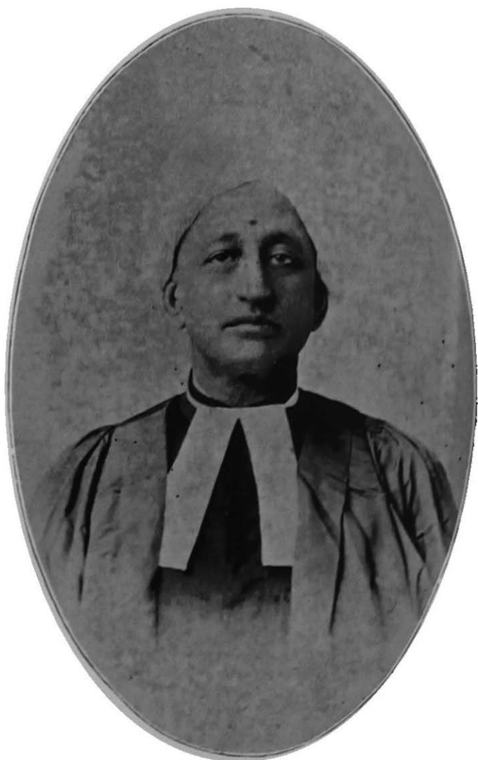
SIR S. SUBRAMANIA AIYER, K.C.I.E., D.L.