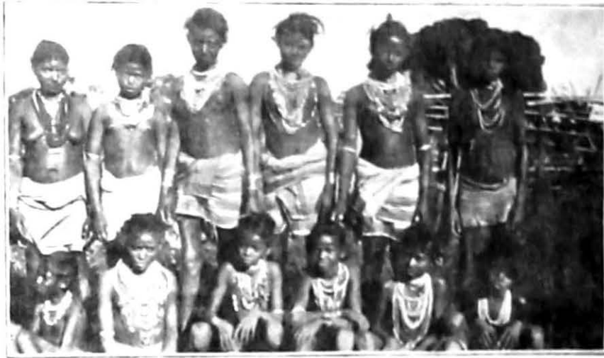
MARIAS OF CHANDA DISTRICT.