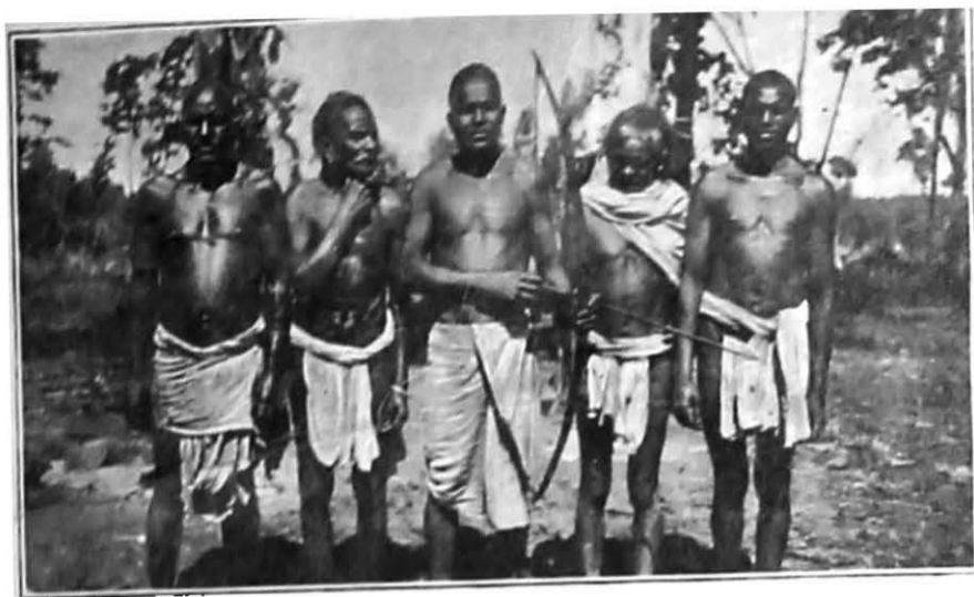
PANDOS. ( Udaipur. )