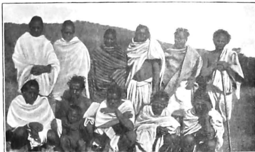
KORWAS ( Jashpur ).