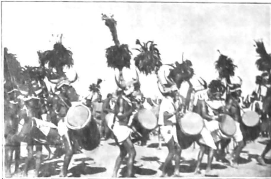
A BISON HEAD MARIA DANCE