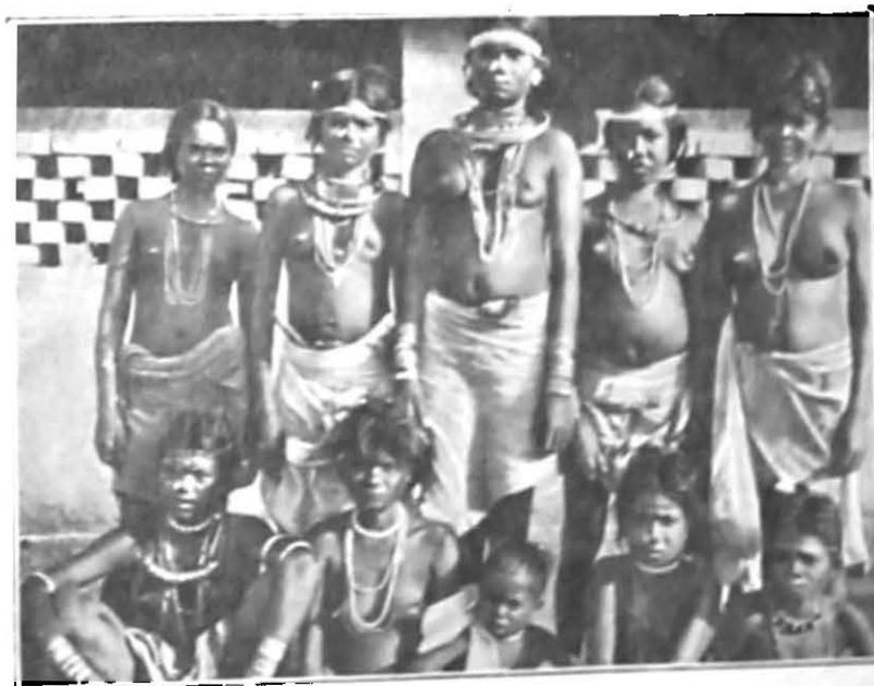
MARIAS OF BASTAR STATE