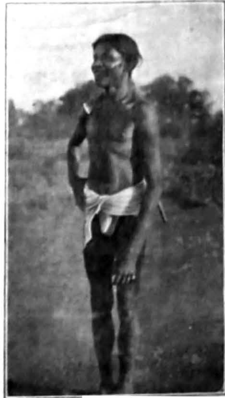
A BISON HEAD MARIA ( Bastar State. )