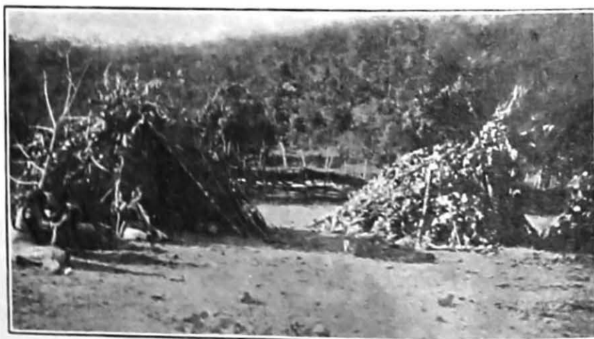
TEMPORARY HUTS OF PAHARI KORWAS.