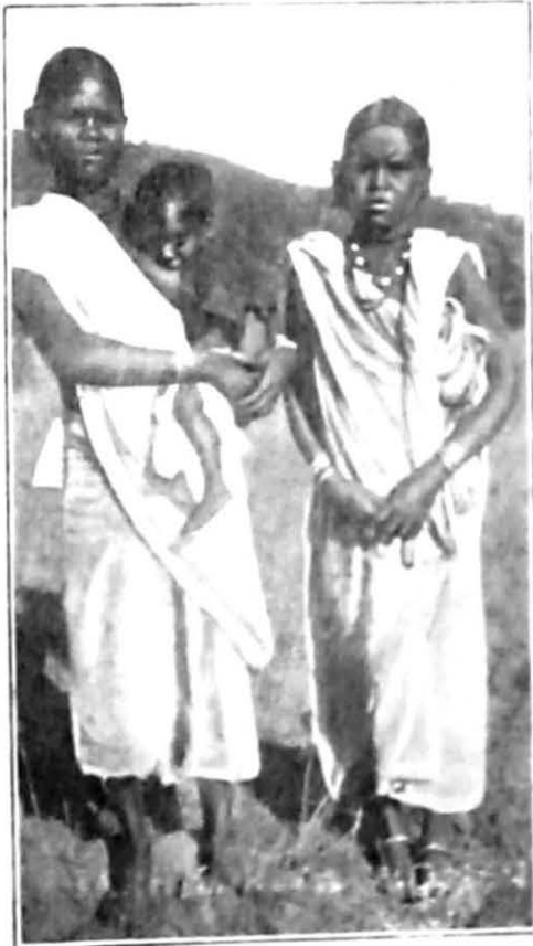
DEHARI KORWA WOMEN