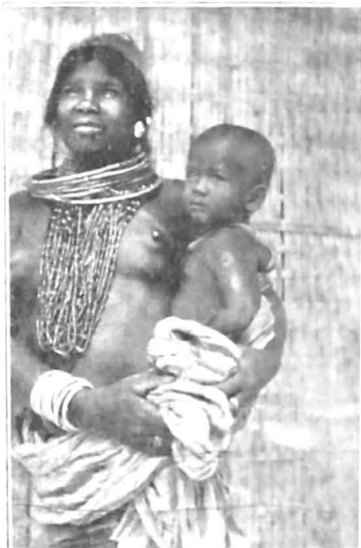
A BISON HEAD MARIA WOMAN