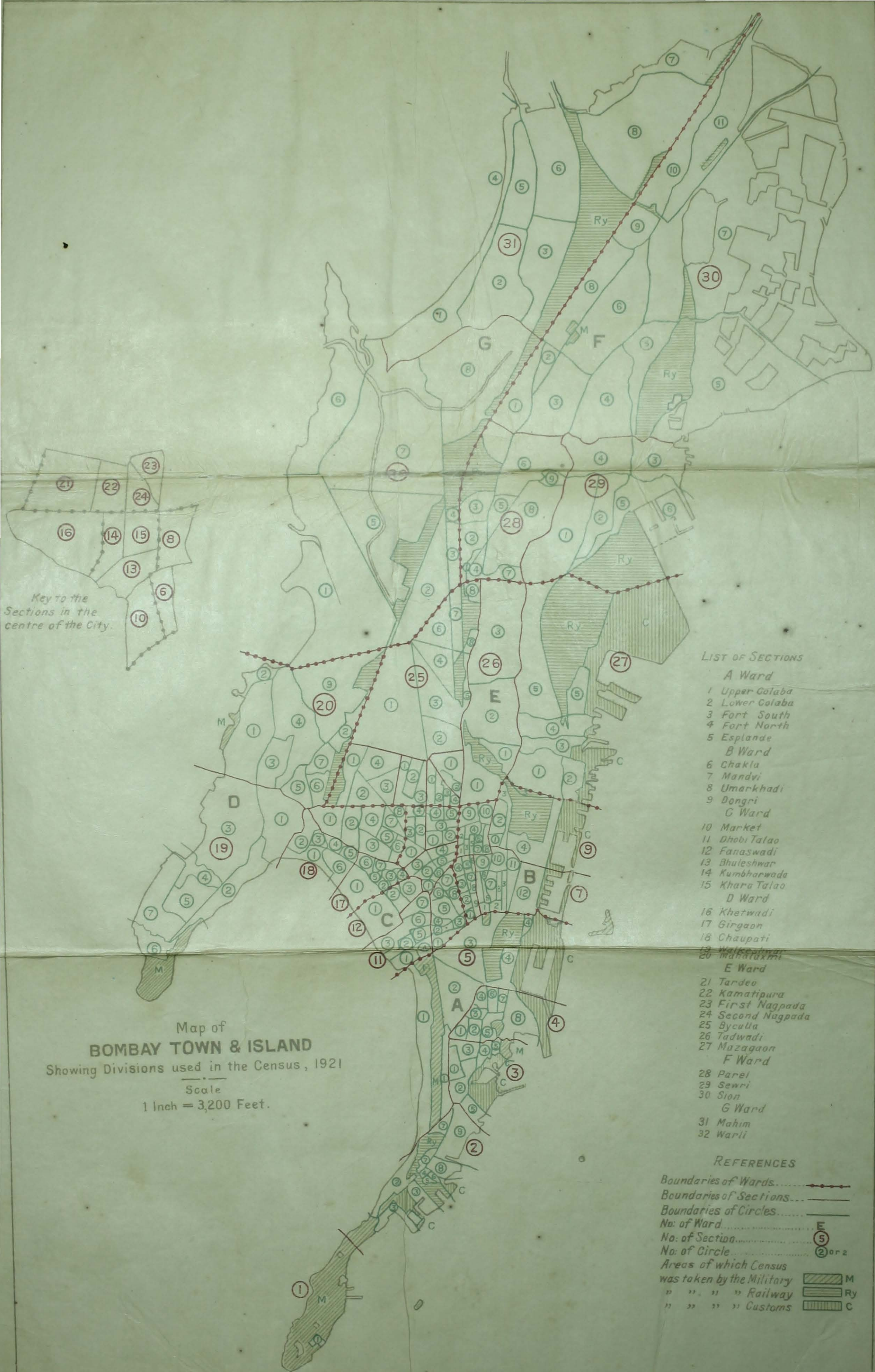
Map of BOMBAY TOWN & ISLAND Showing Divisions used in the Census, 1921