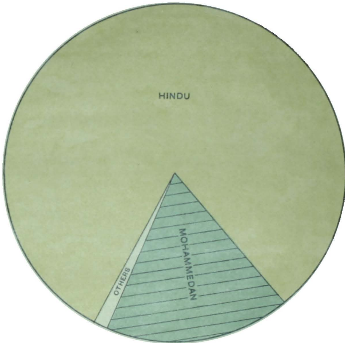
DIAGRAM III SHEWING RELIGIOUS SECTS IN NON-CHRISTIAN POPULATION.