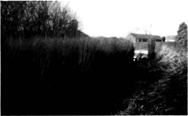
BUNDLES STANDING IN PIT