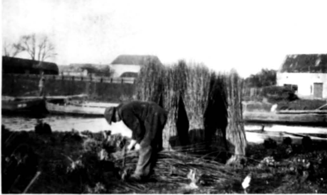
TRIMMING AND TIEING BUNDLES