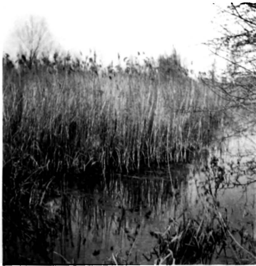
REED BED AT ELY