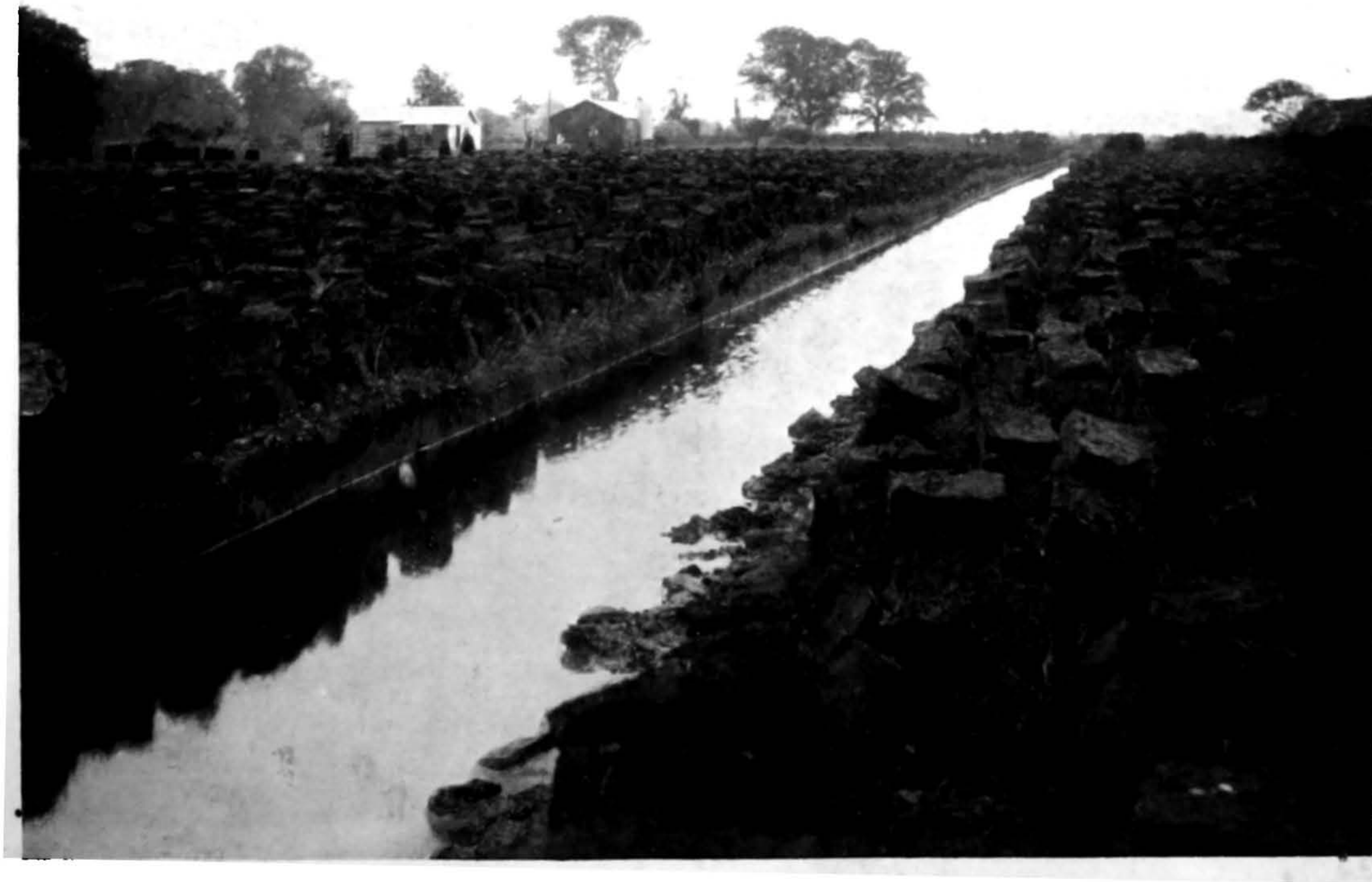
PEAT BED AT MEARE, SOMERSET