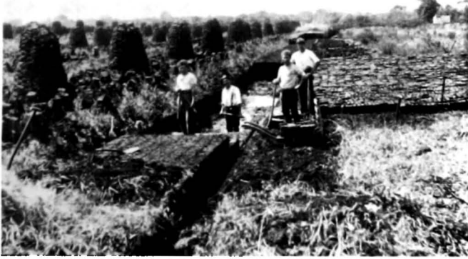
SOMERSET PEAT CUTTERS