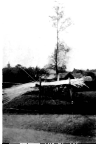
PEELED OSIERS WHITENING IN THE SUN