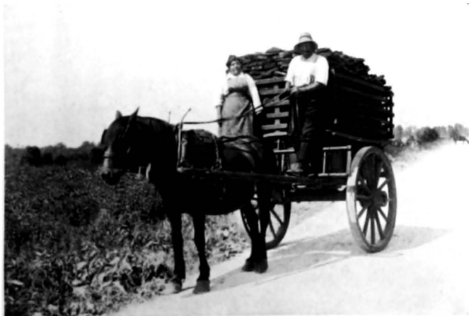
• DELIVERING THEIR PRODUCT