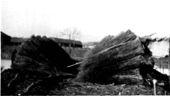
STACKING BROWN RODS