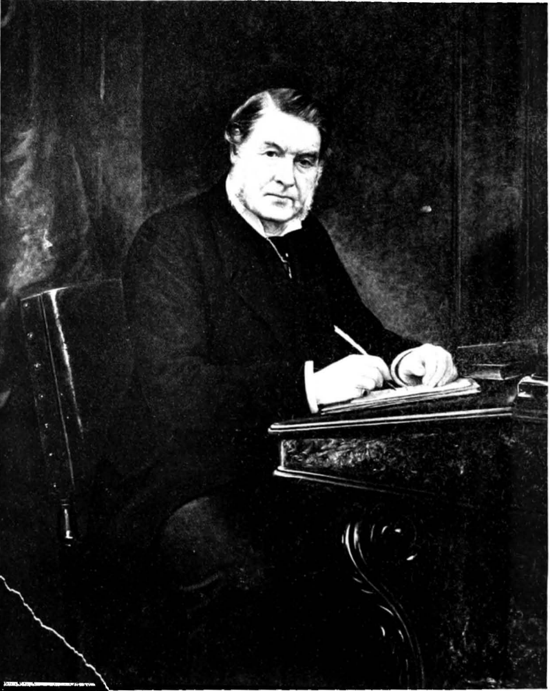
SIR CHARLES TUPPER (1896) Presentation portrait from a few of his London friends