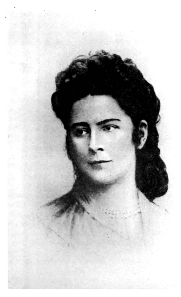
The late Empress Elizabeth.