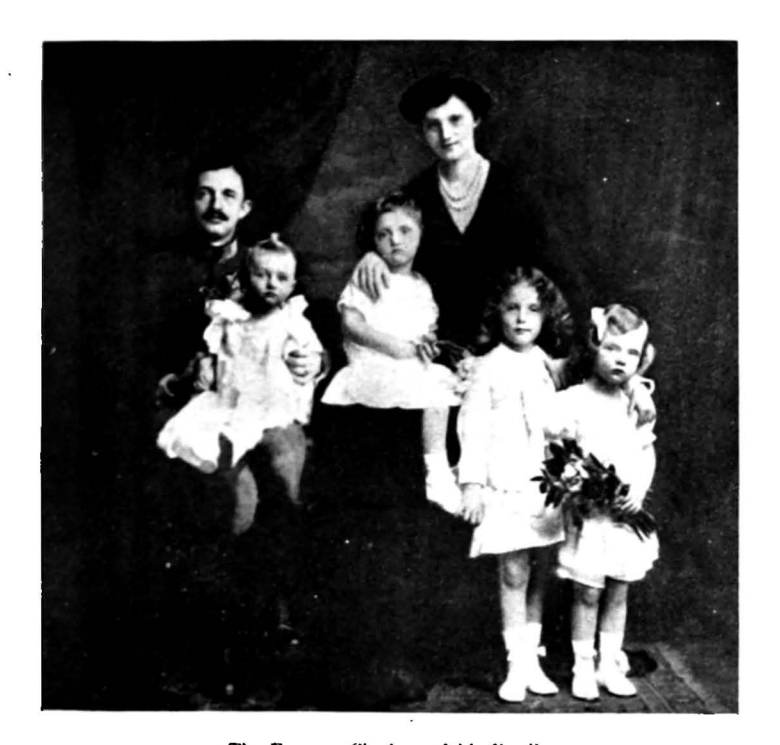
The Emperor Charles and his Family.