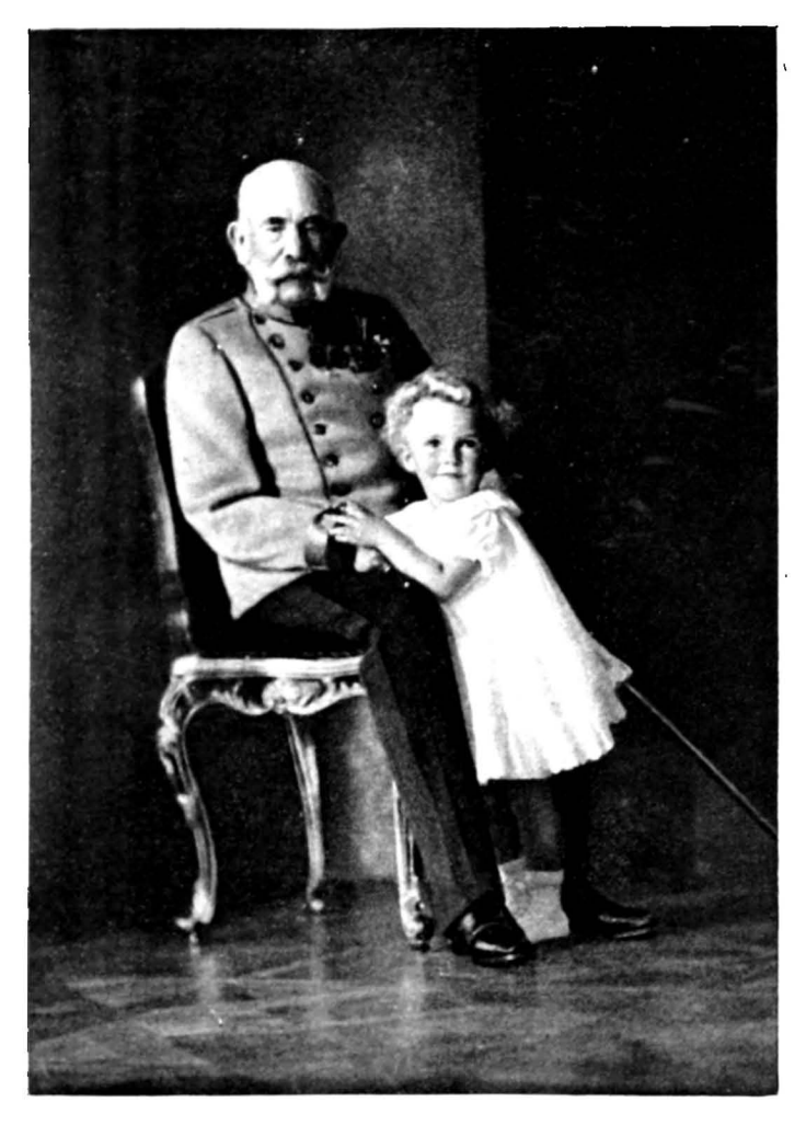
The Emperor Francis Joseph with the Archduke Francis Joseph Otto, son of the Archduke Charles. (Photo taken September 15, 1914.)