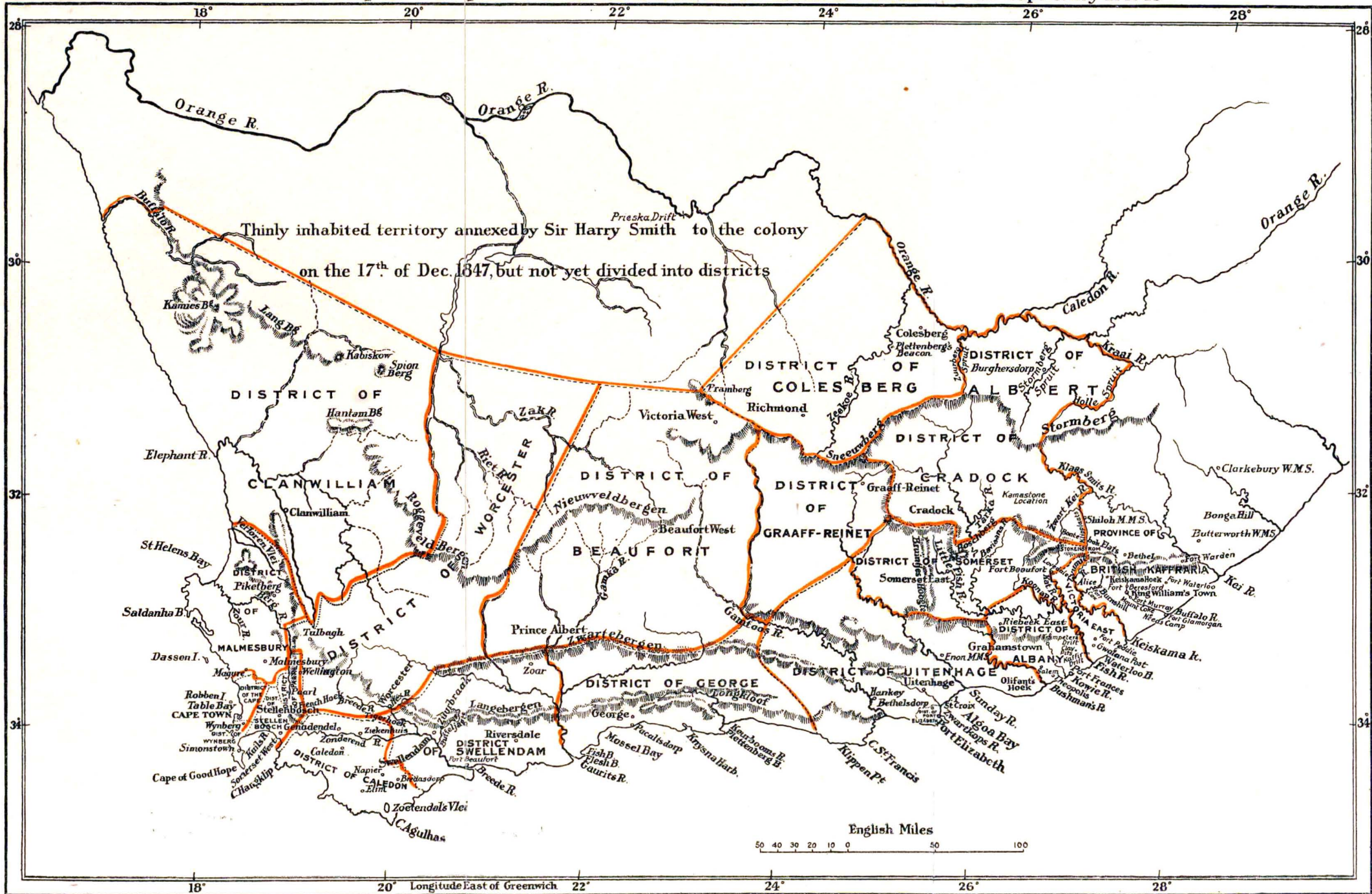
This map shows the province of British Kaffraria and the extent and divisions of the Cape Colony in 1848