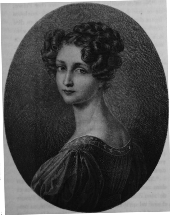
ARCHDUCHESS SOPHIA OF AUSTRIA, MOTHER OF FRANCIS JOSEPH.