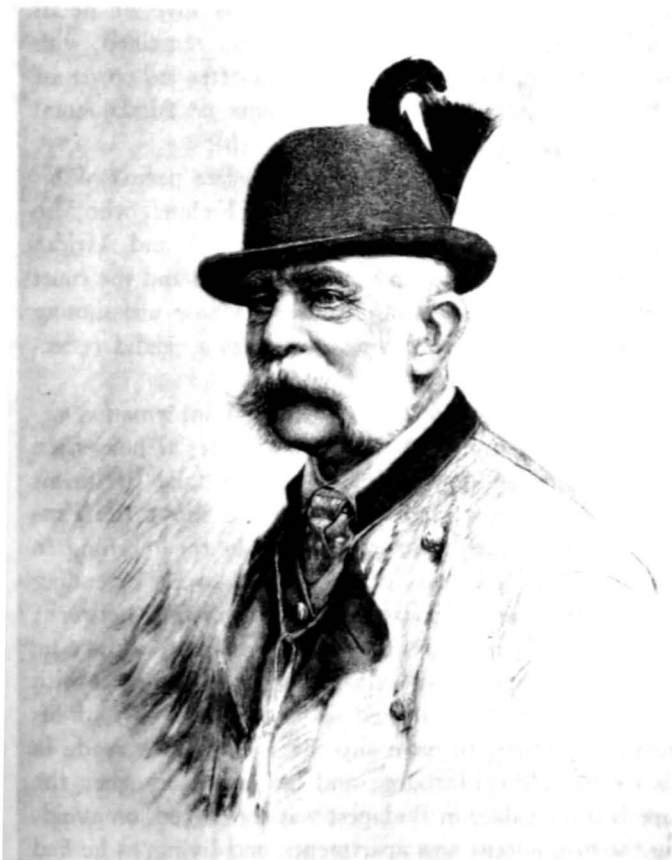
FRANCIS JOSEPH IN THE DRESS OF A TYROLESE MOUNTAINEER AND HUNTSMAN (ABOUT 70 YEARS OLD)