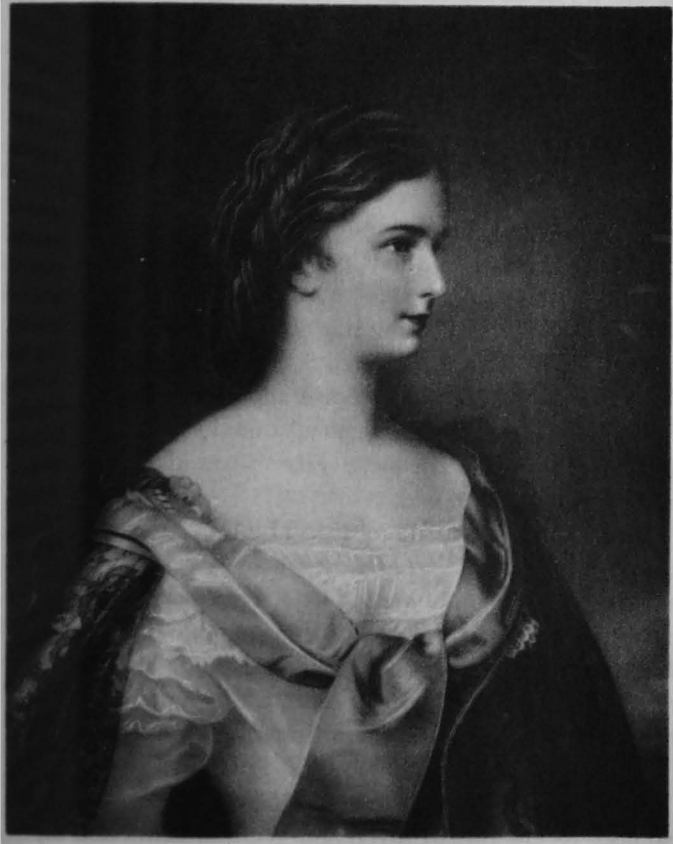
EMPRESS ELISABETH OF AUSTRIA IN 1830