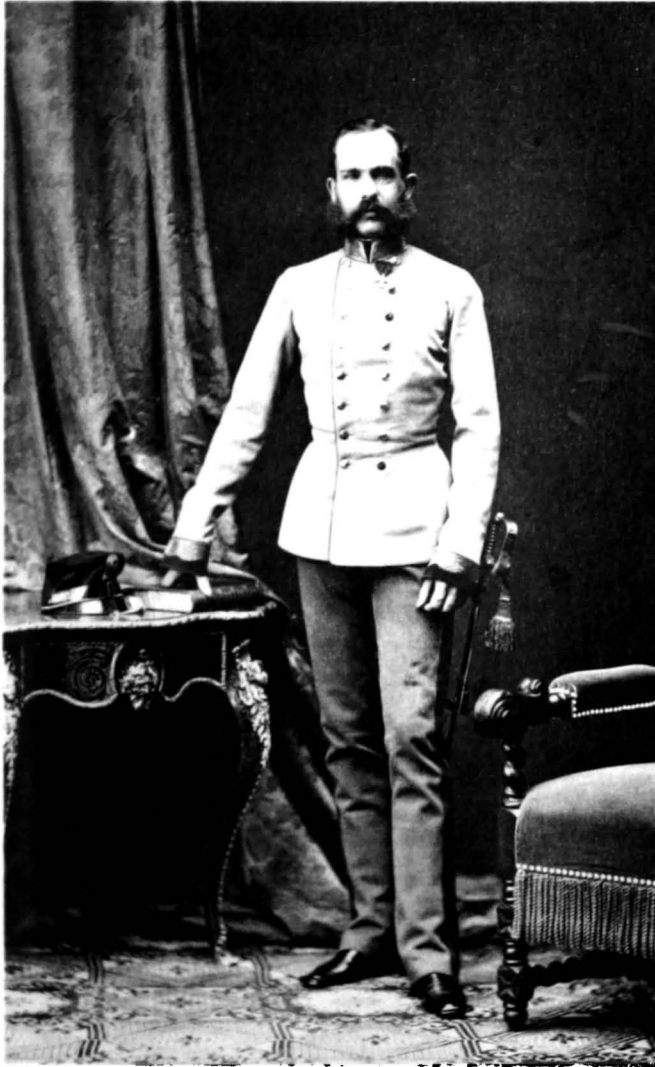
EMPEROR FRANCIS JOSEPH IN THE YEAR 1861 (AFTER A PRIVATE PHOTOGRAPH)