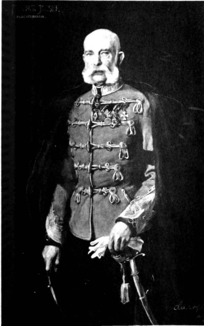
EMPEROR FRANCIS JOSEPH AT SEVENTY