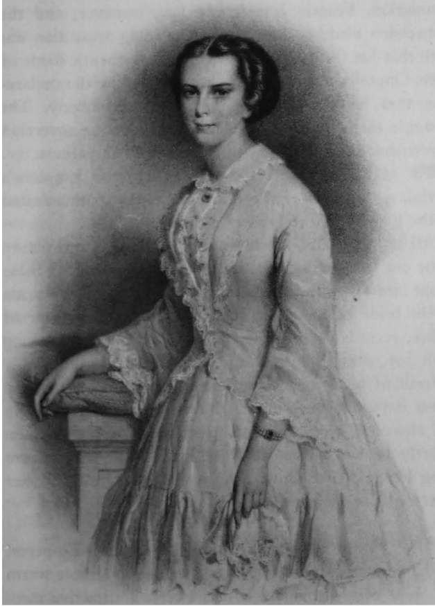
PRINCESS ELISABETH OF BAVARIA AT SEVENTEEN