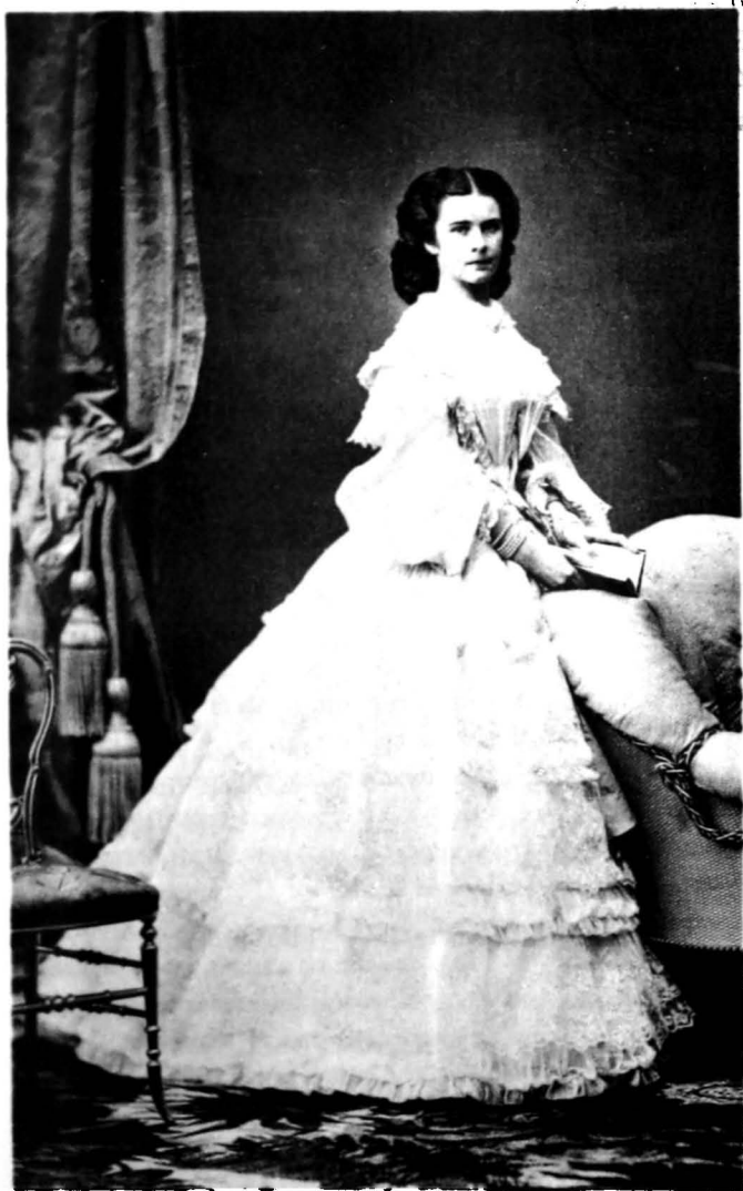
EMPRESS ELISABETH OF AUSTRIA IN THE YEAR 1861