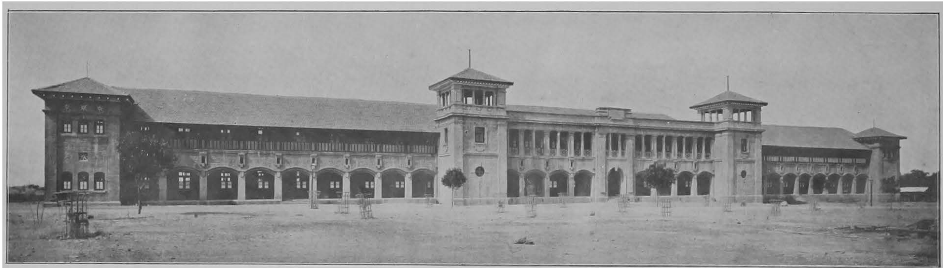
AGRICULTURAL COLLEGE, POONA.