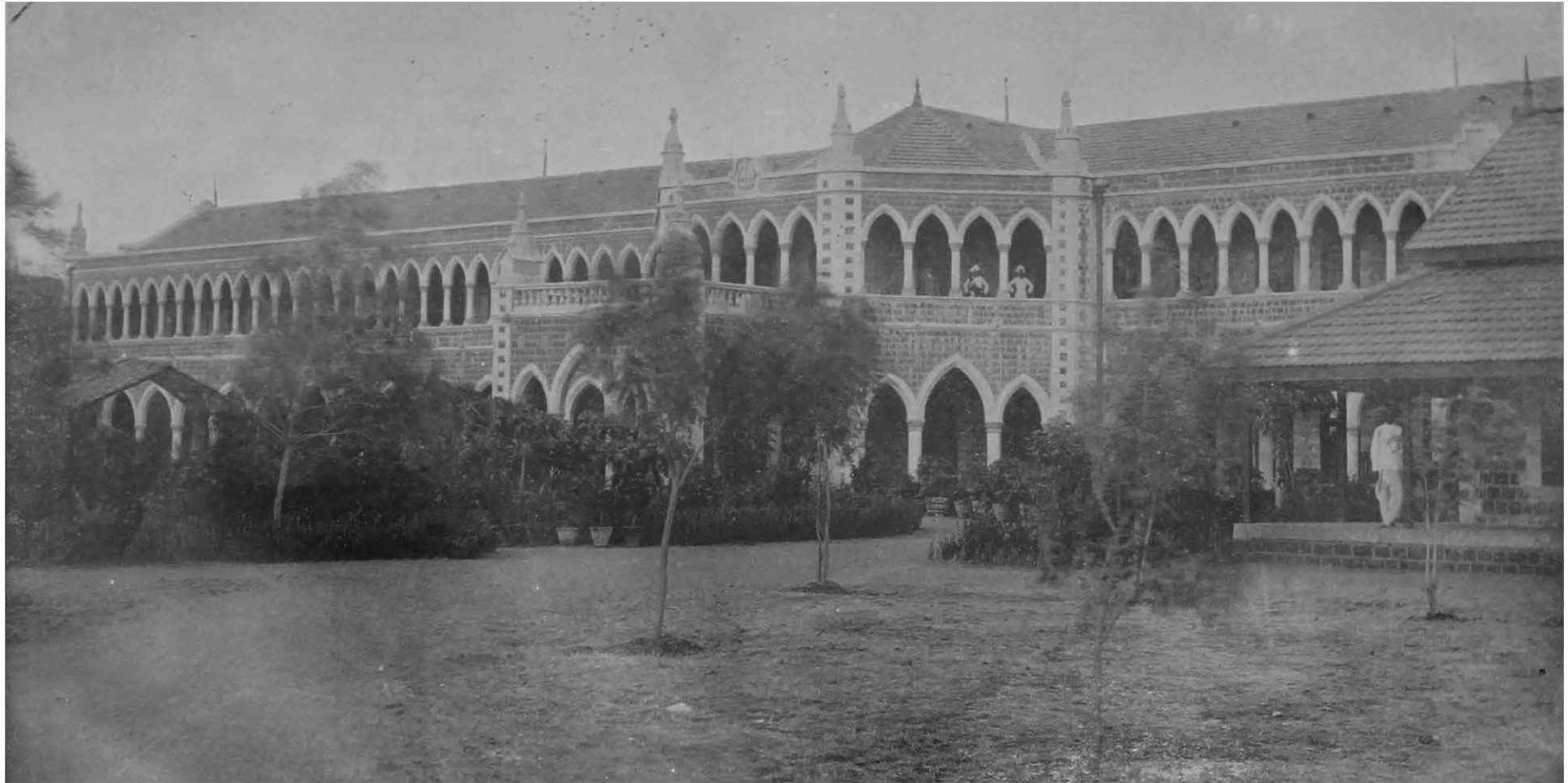
Revenue Buildings at Jalgaon.