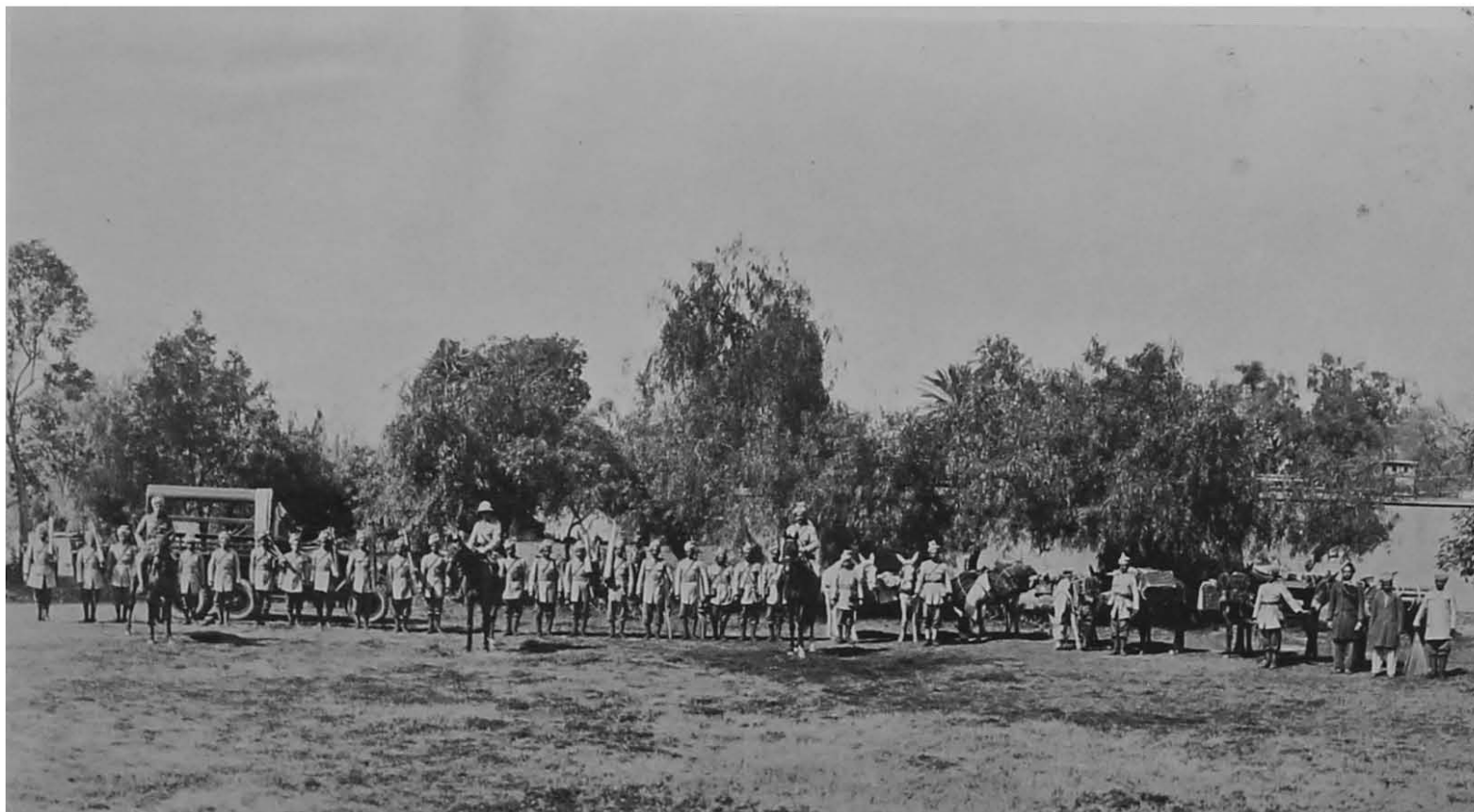
KHAJURI PLAIN OPERATIONS N. W. F. P. 1930-31. INDIAN FIELD SURVEY SECTION.