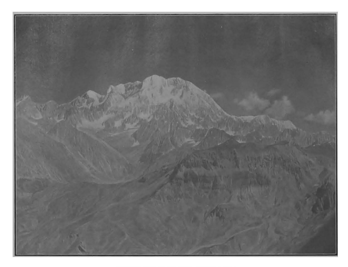
TIRICH MIR FROM THE SOUTH EAST.