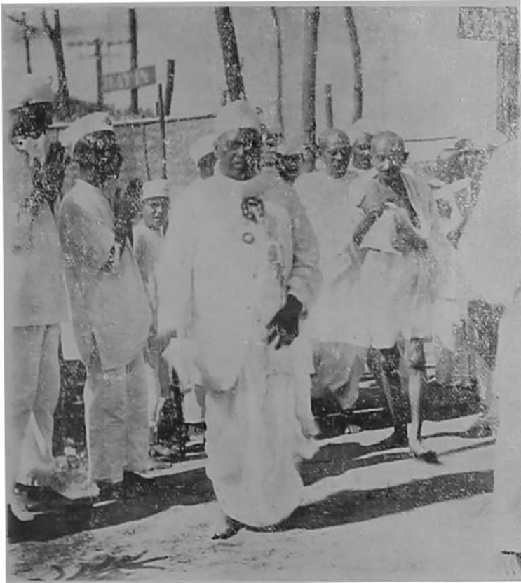
RECEPTION TO MAHATMA GANDHI.