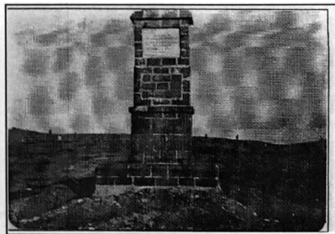
Plaque on Fergusson Hill (Hunuman Tekdi) where Gokhale alongwith three colleagues took oath to serve the people and founded Servants of India Society on June 12, 1905