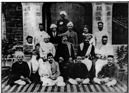
First group of members of the Servants of India Society

Shri G. K. Gokhale is seated in the centre