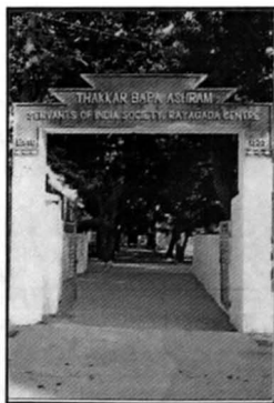
Rayagada Centre, Orissa