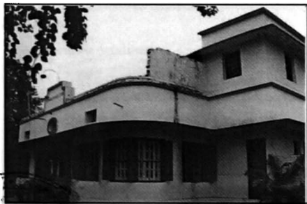
Cuttack Head Office