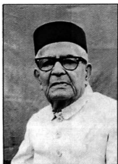
Pandit H. N. Kunzru