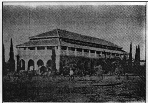
Servants of India Society's Main Building, Pune