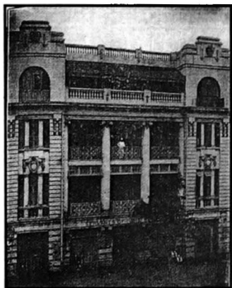
Mumbai Head Office