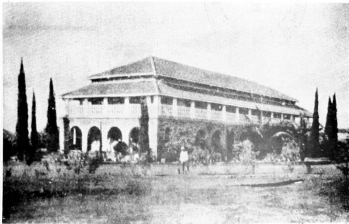
Servants Of India Society's Main Building, Pune.