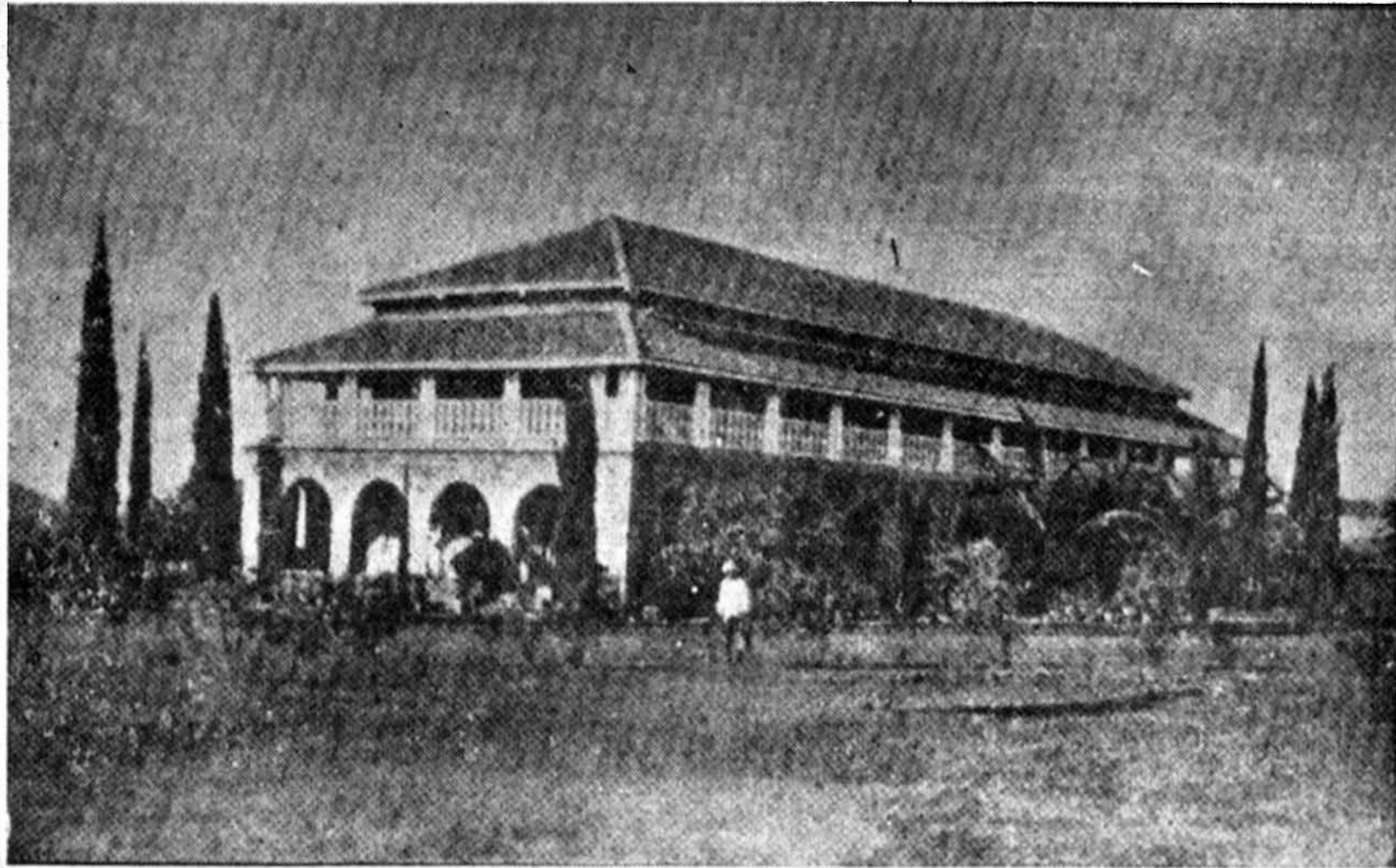
Servants of India Society's Main Building ( Pune )