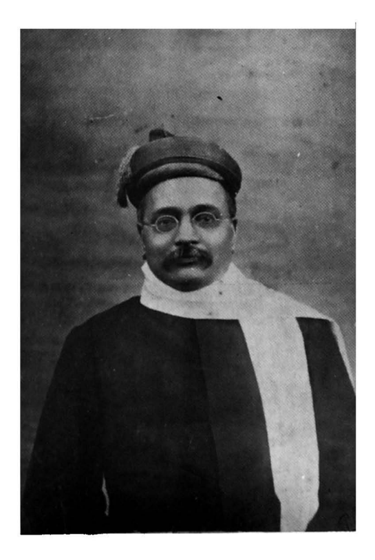
FOUNDER The Servants of India Society