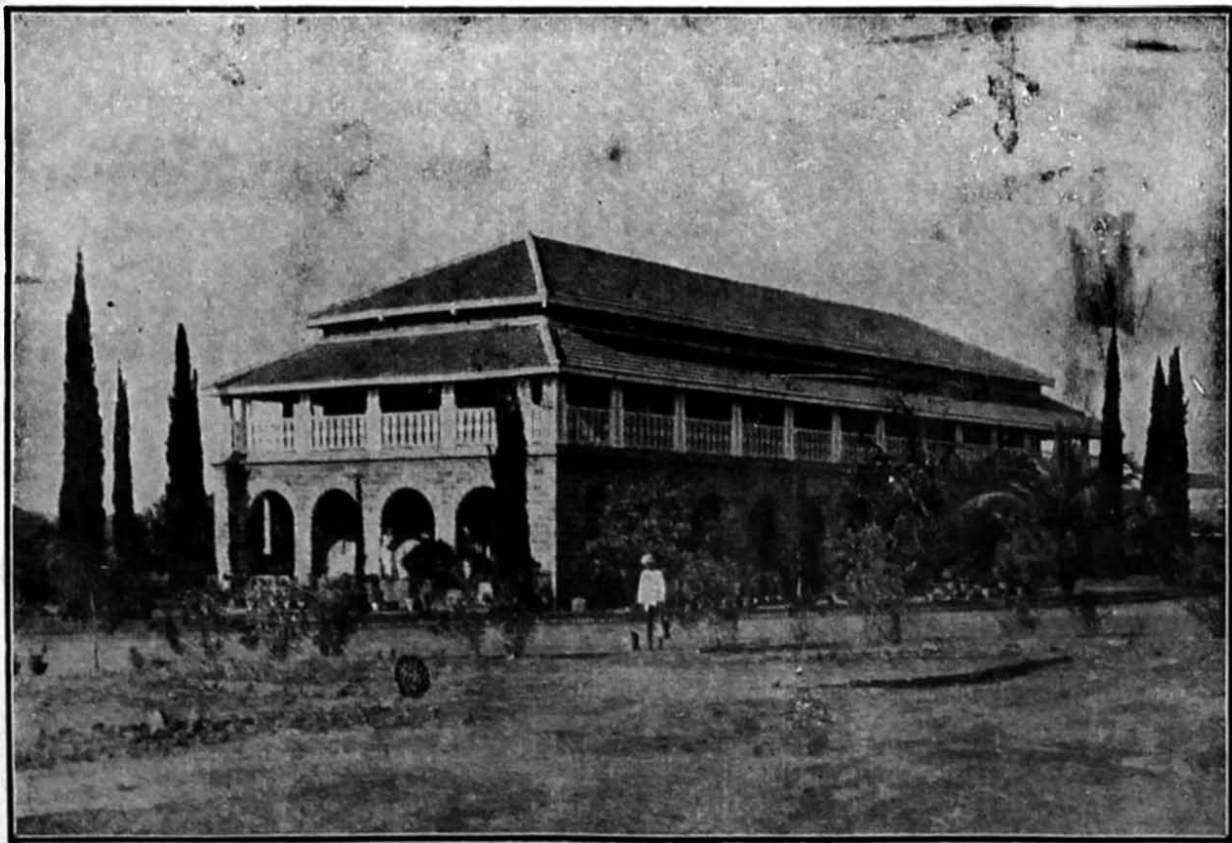
View of the Central Library of the Society, Pune.