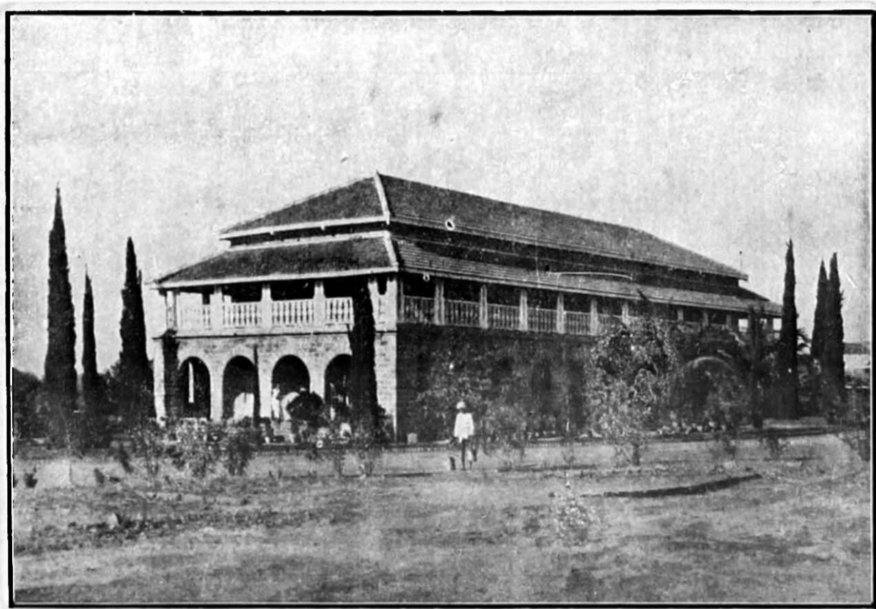
View of the Central Library of the Society, Pune.