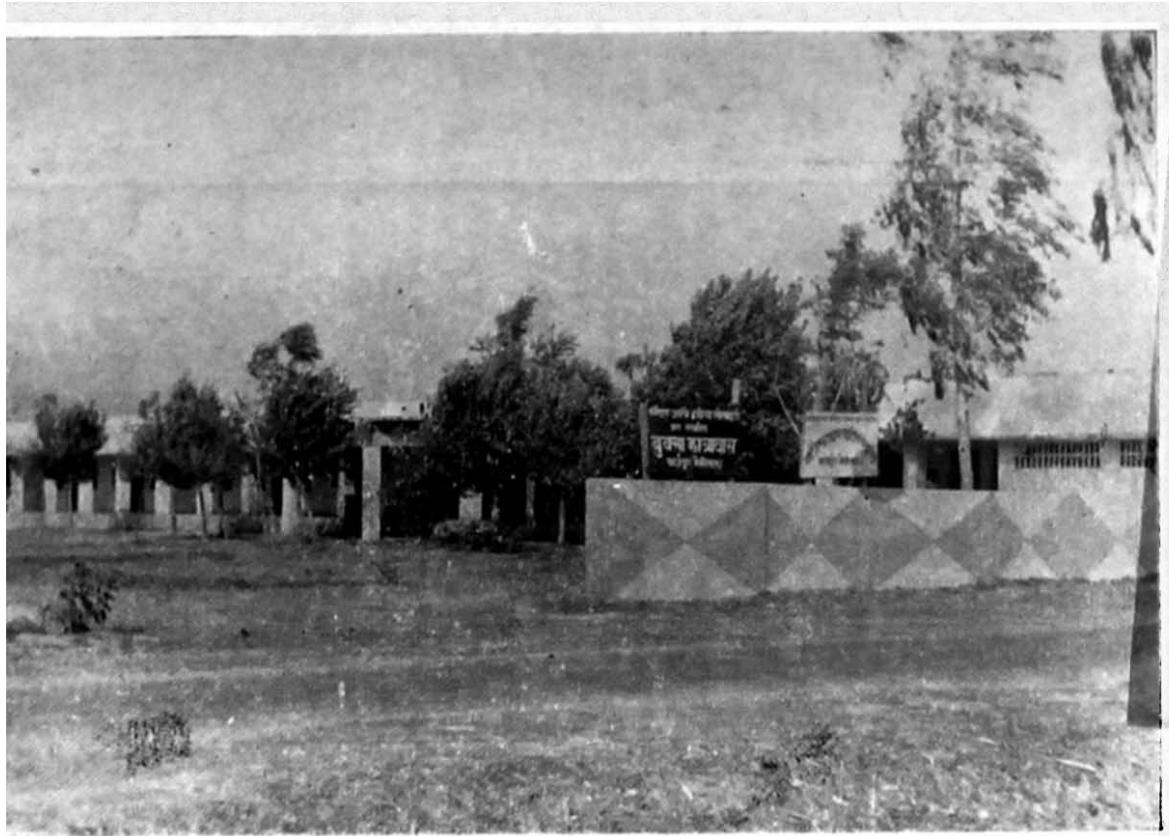
Boys' Hostel—Bazpur, Dist. Nainital.