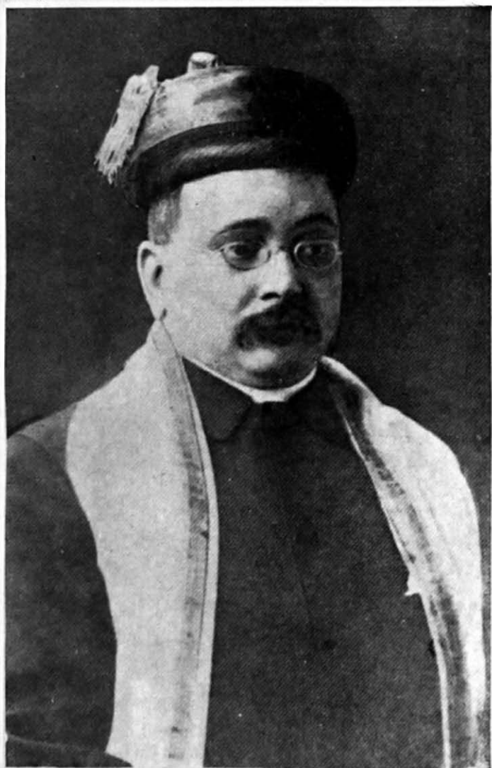
The Hon'ble Mr. G. K. Gokhale