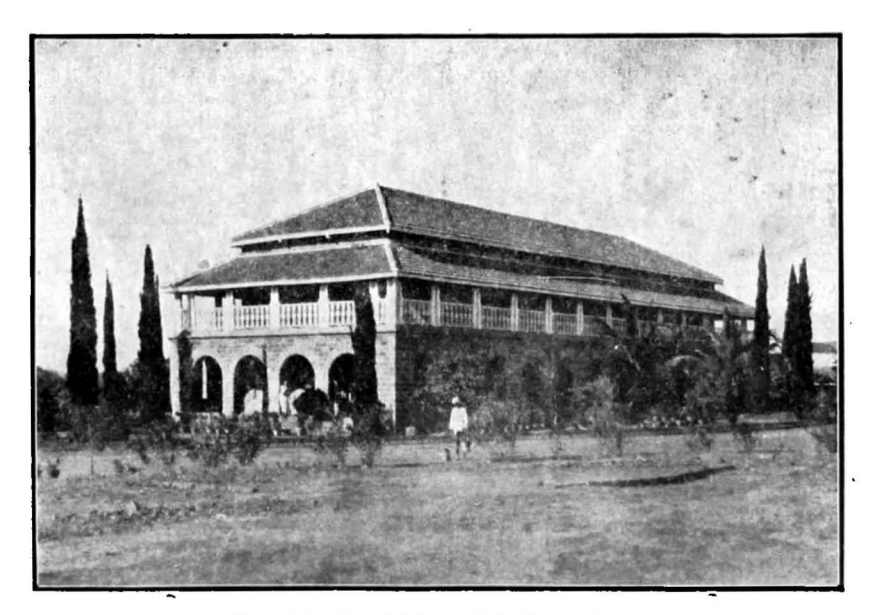
View of the Central Library of the Society Poons