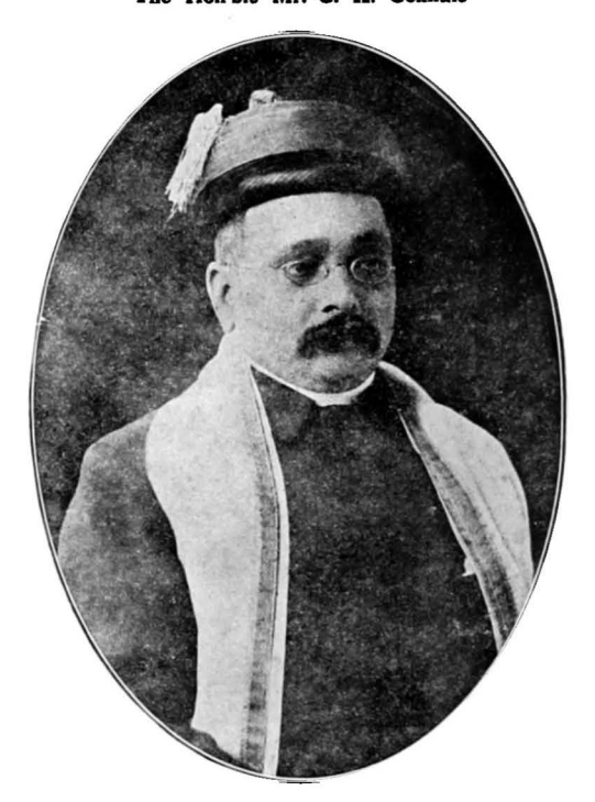
FOUNDER The Servants of India Society