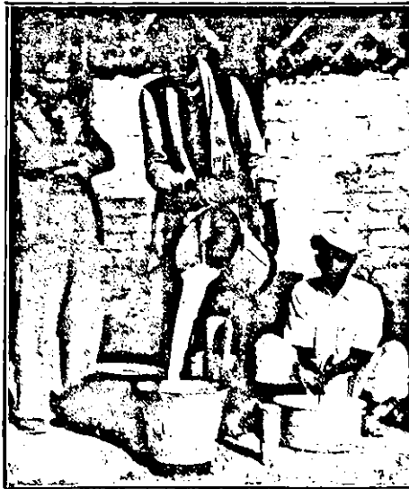
Milk being prepared for distribution.