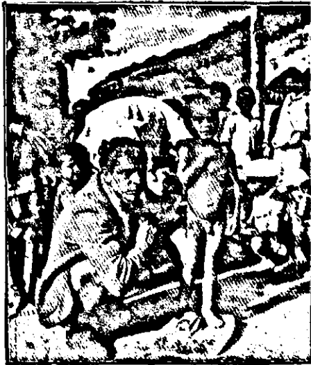
An Adivasi child being weighed.