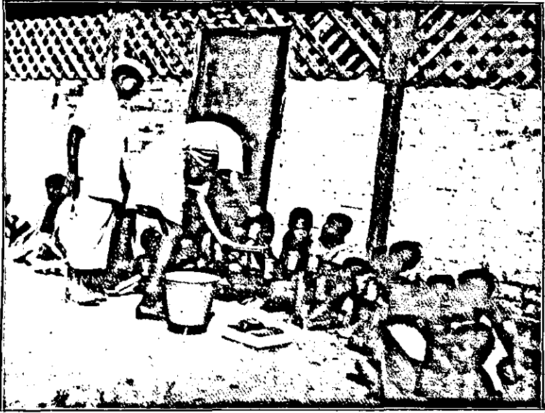
Milk distribution at Kathla.