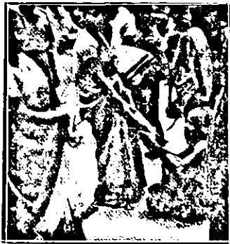
Cloth Distribution at Mulavor.