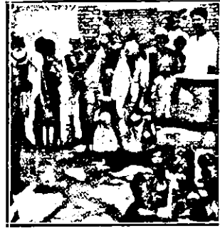
Karvetinagar Milk Centre.