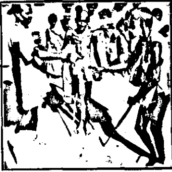
Milk Centre at Gorantla, Anantapur District.