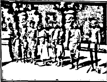
Harijan women and children at Gorantla, Anantapur District.