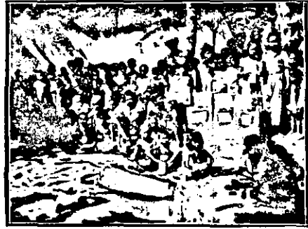
Milk Distribution at Madras.