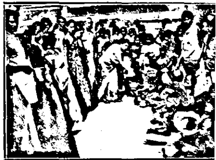
A Milk Centre in Dhonapuram Taluk, Coimbatore District.