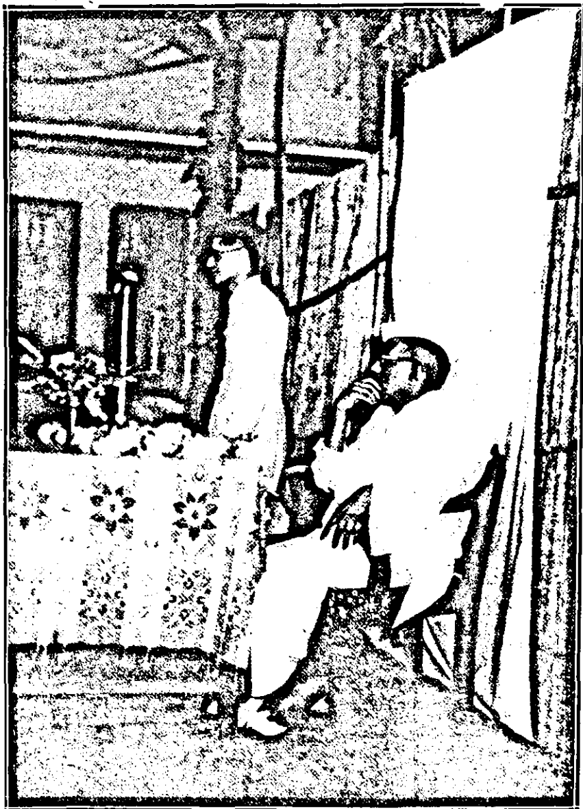
Pandit H. N. Kunzru speaking at the Opening Ceremony of the Home for the Orissa Centre.