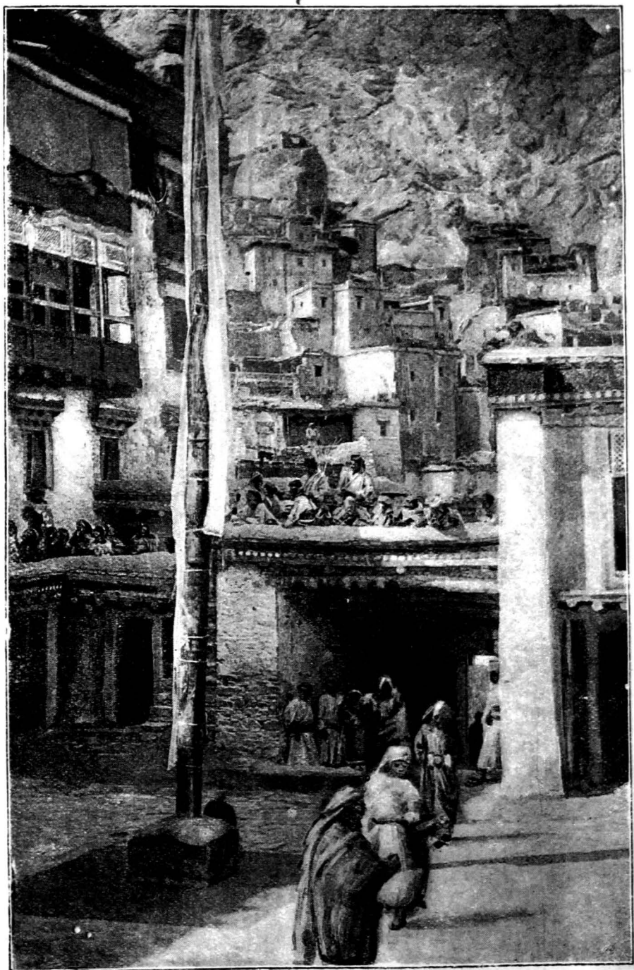
EN HIMIS LAMABRY.