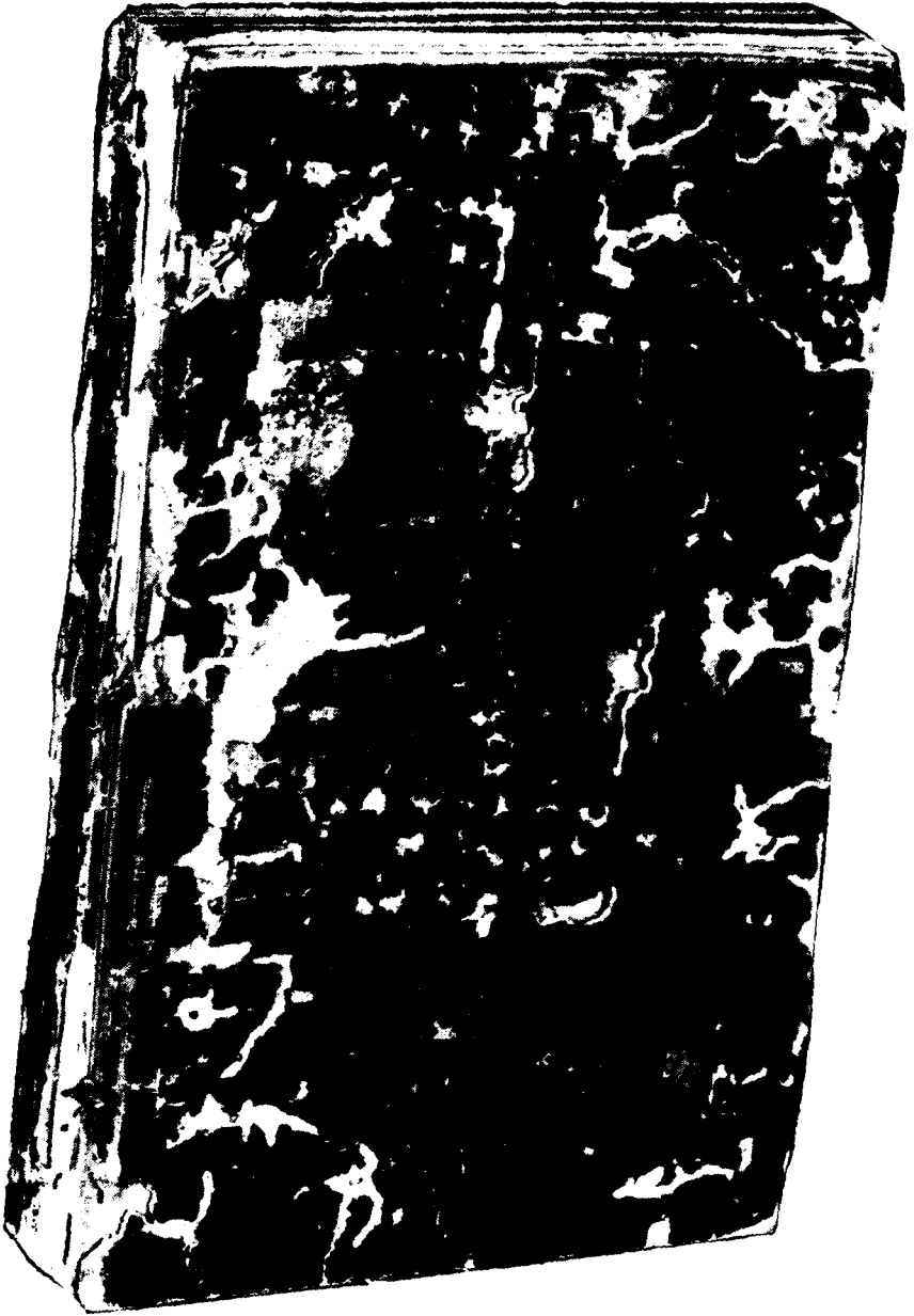
A PHOTOGRAPH OF THE BOOK IN WHICH THE AUTOBIOGRAPHY WAS WRITTEN.