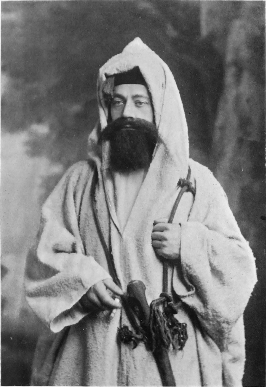
THE AUTHOR IN MOORISH GUISE