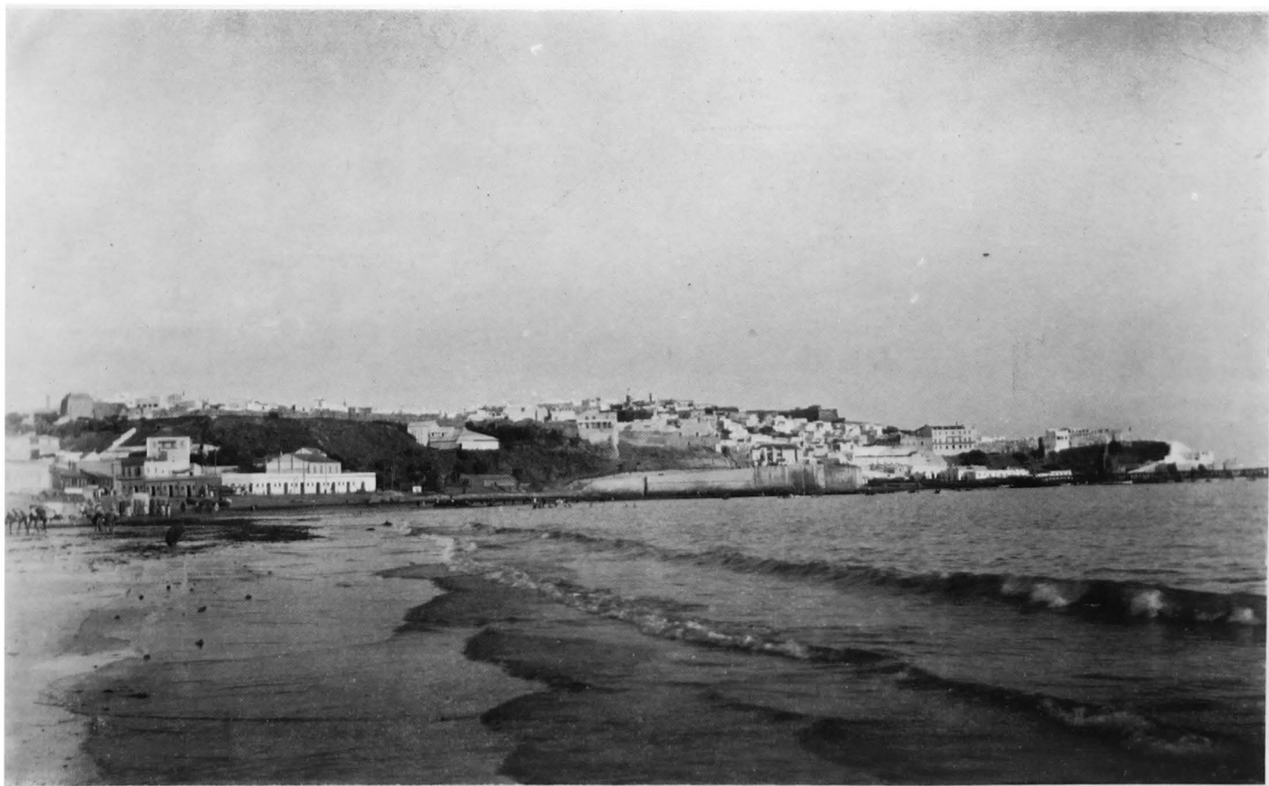
“WITHIN A FEW HOURS’ JOURNEY OF GIBRALTAR”—TANGIER, FROM THE BAY