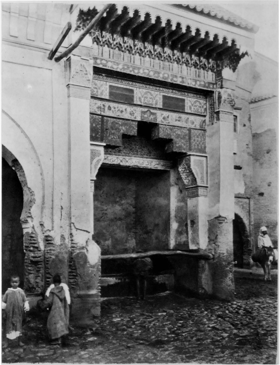
A FOUNTAIN NEAR "THAT FAR OFF COURT" AT MARRAKISH