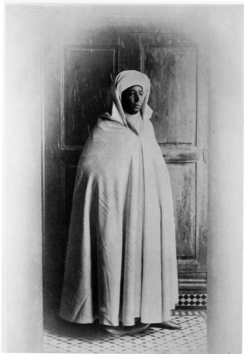
THE SULTAN OF MOROCCO: MOULAI ABD EL AZIZ IV