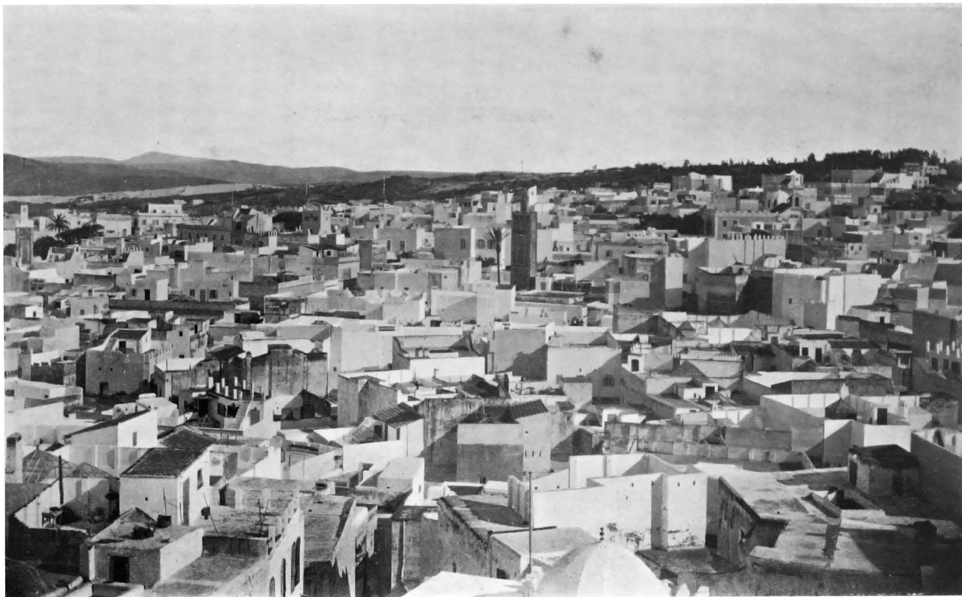
THE WHITE ROOFS OF THE FIRST AND LAST TOWN SEEN BY THE VISITOR TO MOROCCO: TANGIER