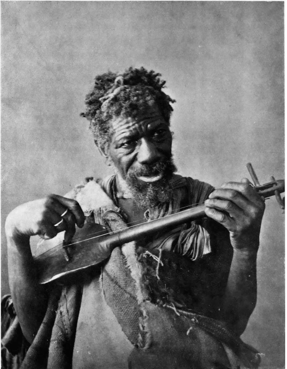
WAYSIDE ENTERTAINERS IN MOROCCO: A VERY OLD HAND AT THE GIMBRI