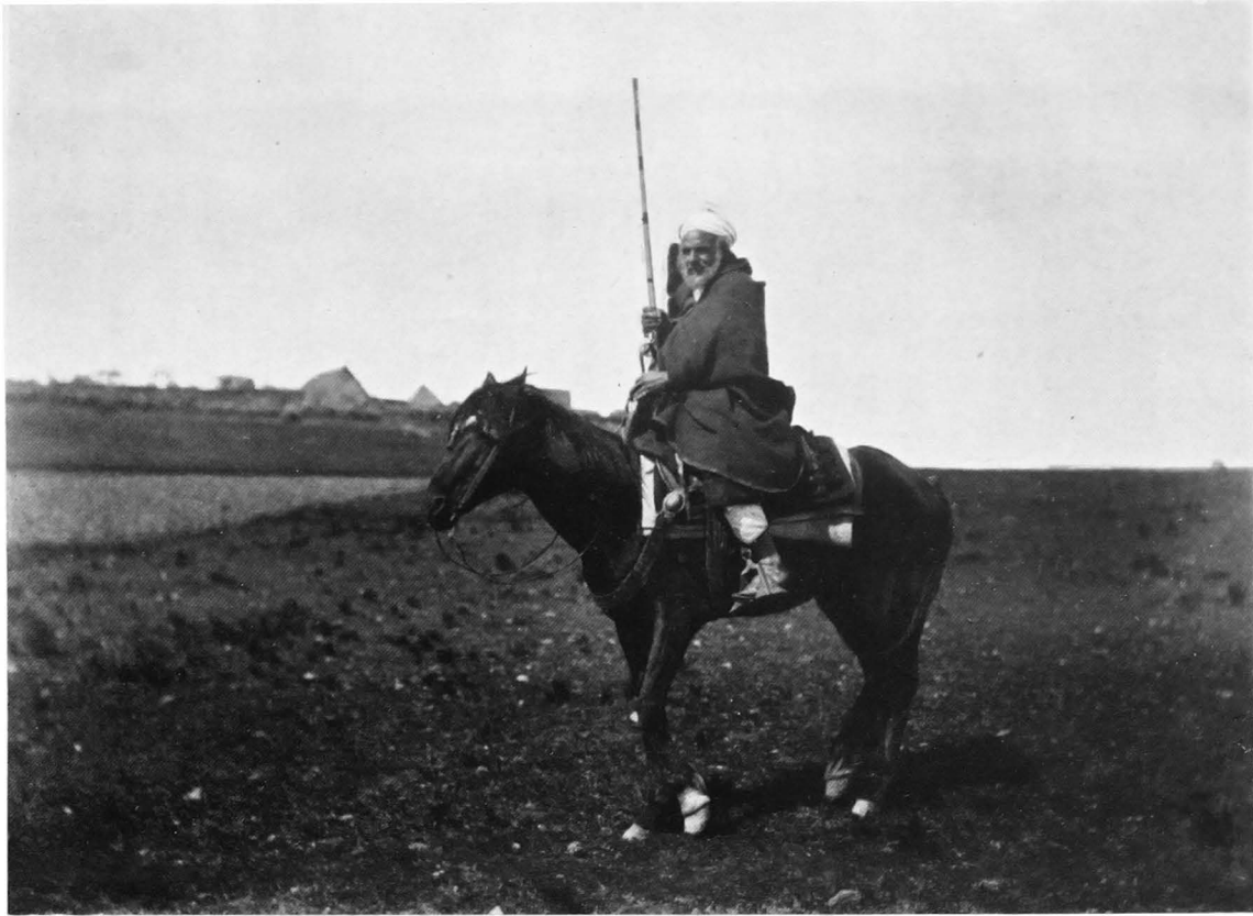
THE MOORISH SOLDIER—FROM LIFE; AN ELDERLY BUT AVERAGE SPECIMEN