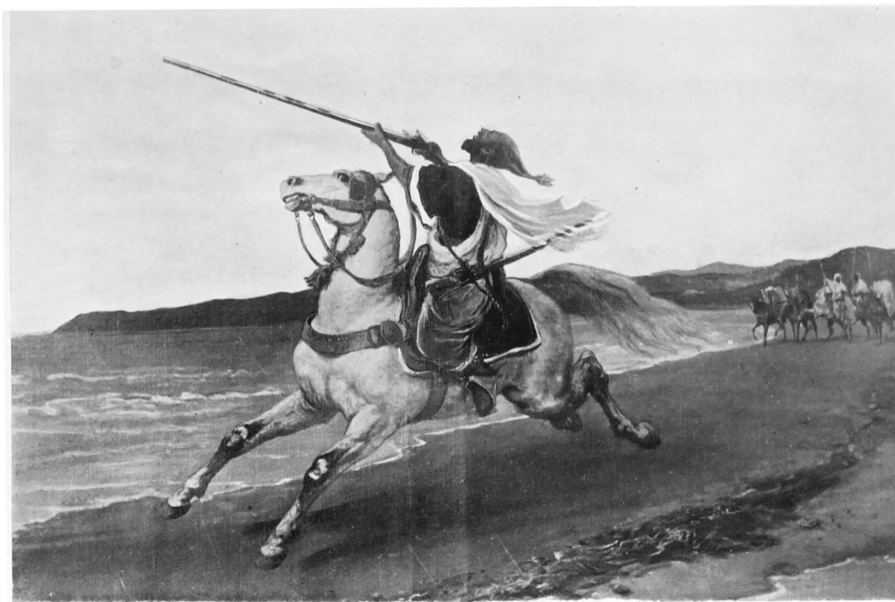
THE MOORISH SOLDIER—AS DEPICTED BY AN ARTIST OF THE NAZARENES