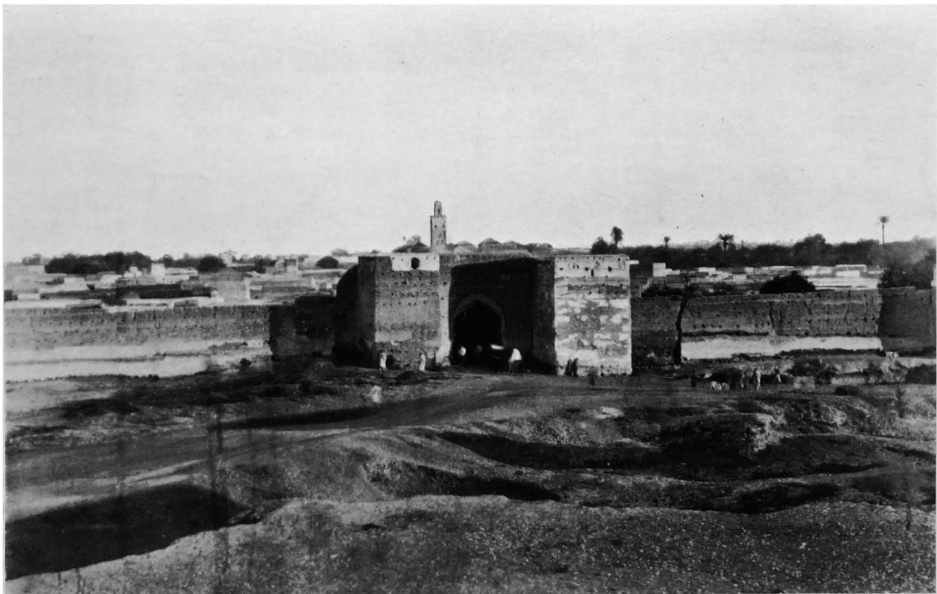
AT THE CITY GATES—MARRAKISH