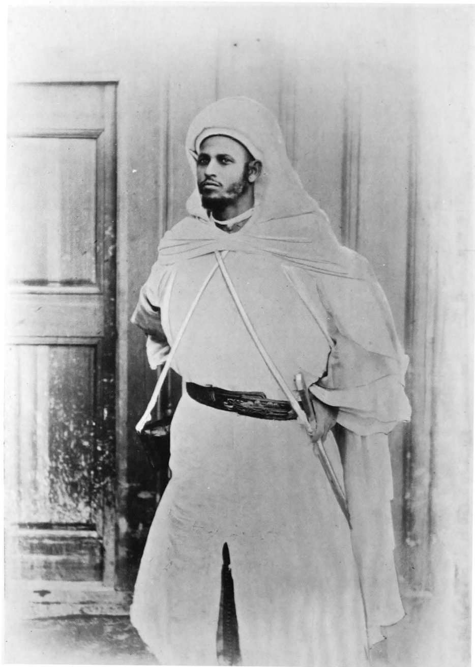
K A I D M E H E D D I E L M E N N E B H I