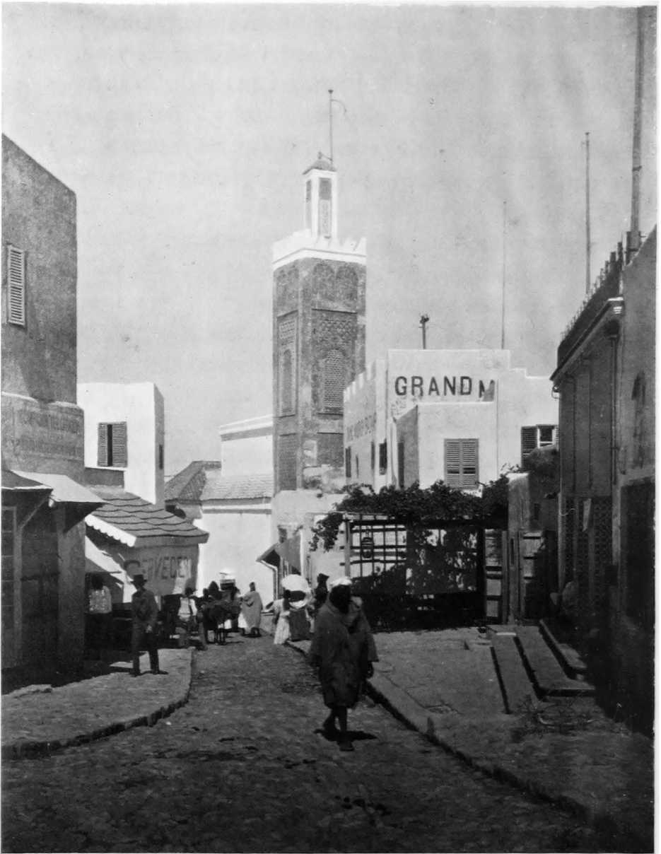
THE MAIN STREET OF TANGIER