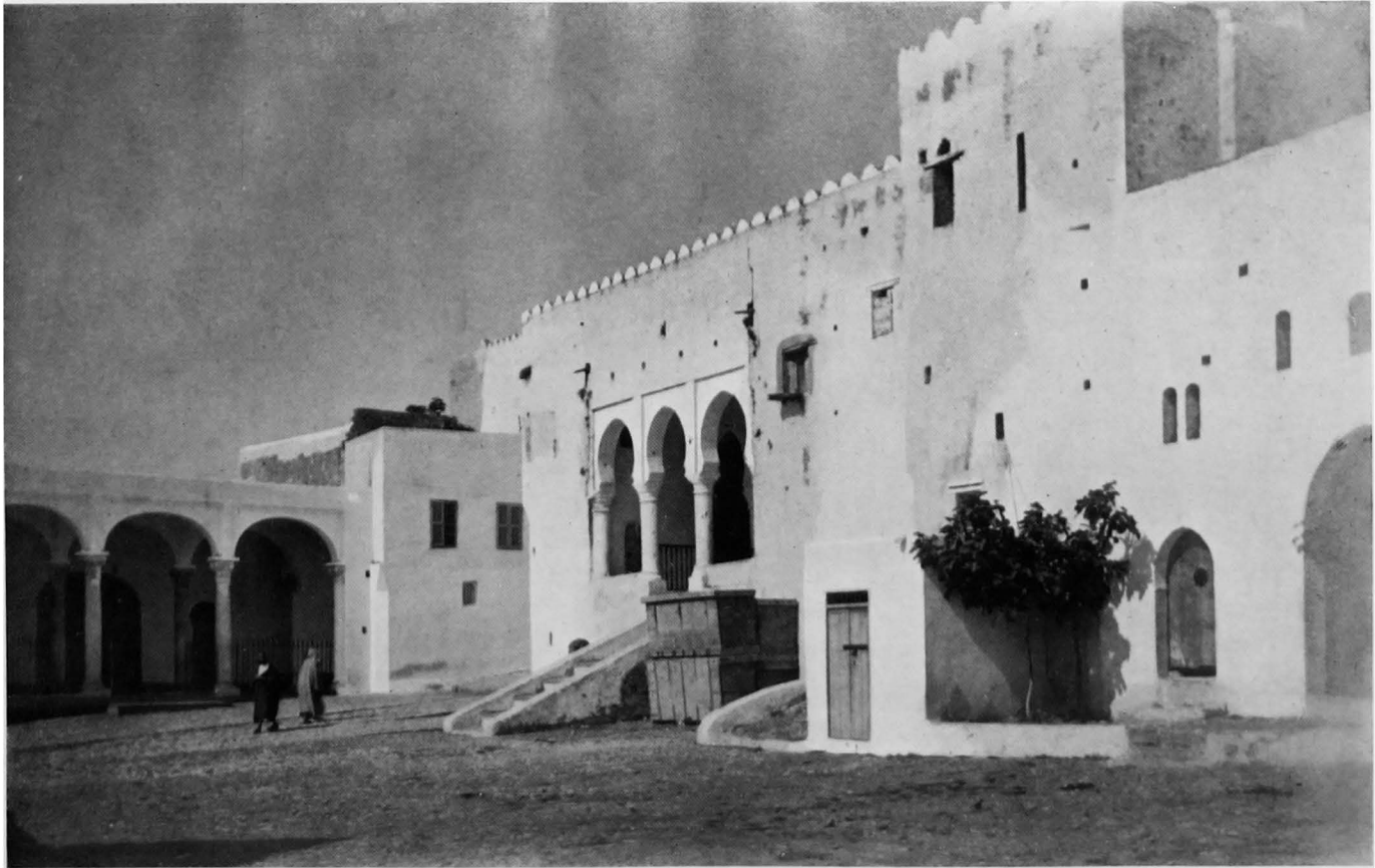
WHERE THE BASHA OF TANGIER HOLDS HIS COURT