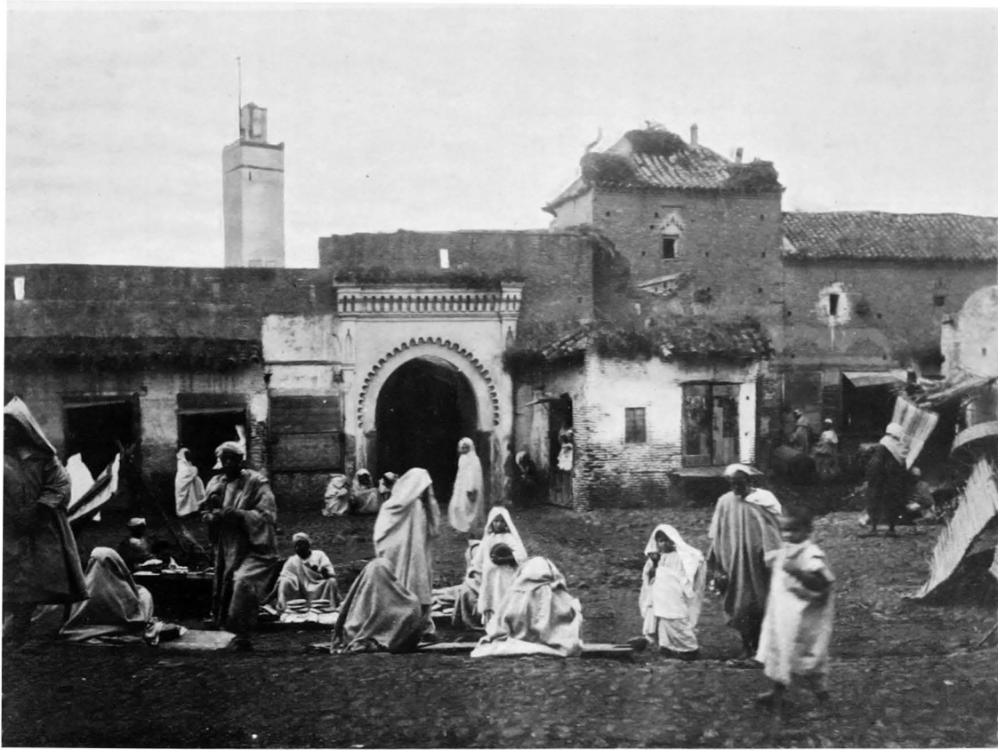
TOWN-GATE IDLERS: AL KSAR EL KEBEER