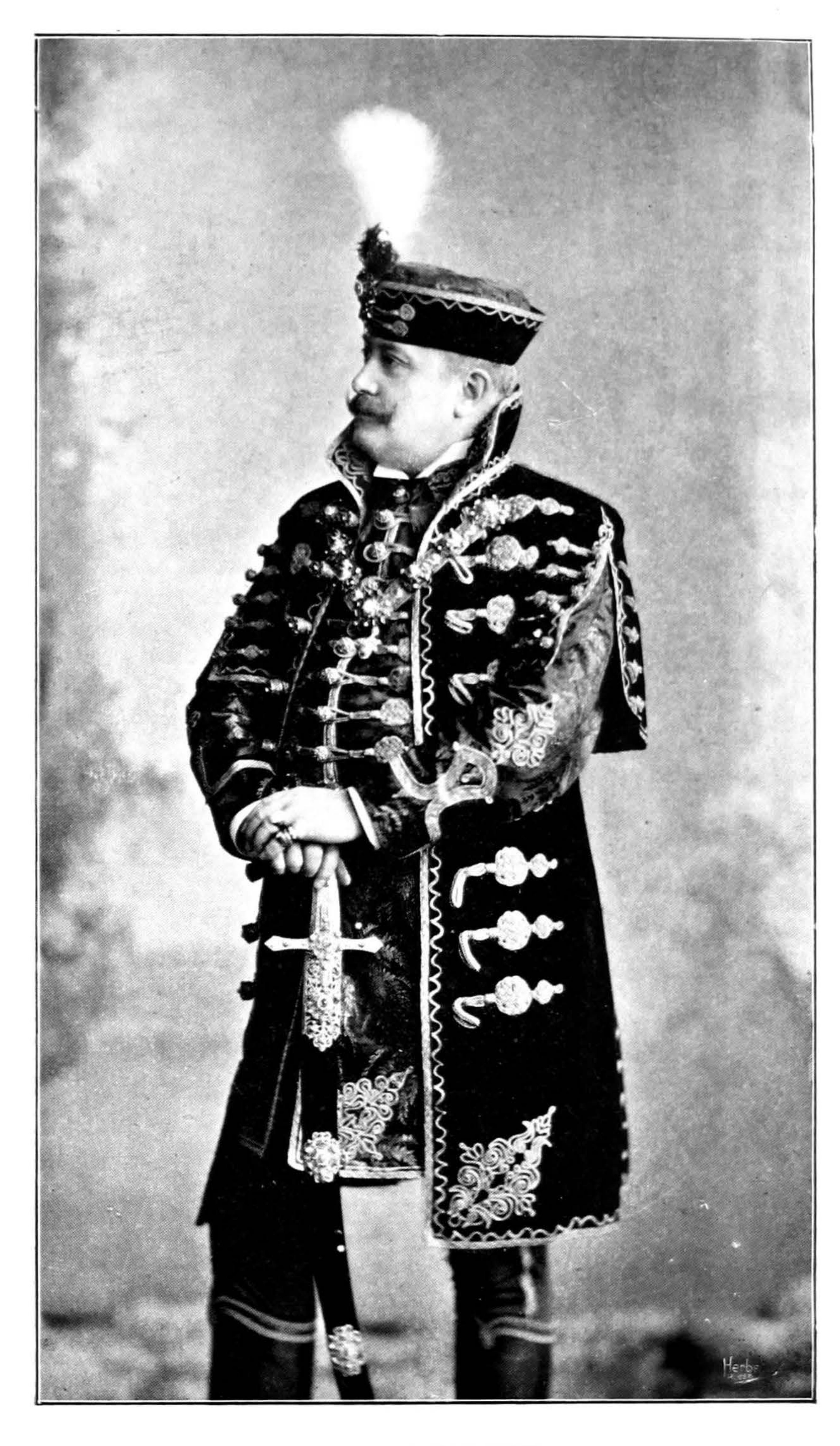
FRANCIS KOSSUTH. (Royal Hungarian Minister of Commerce.)