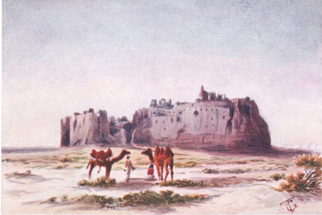
TRĀKUN ON THE RUD-I-BIYABĀN. (From a Sketch by the Author.)