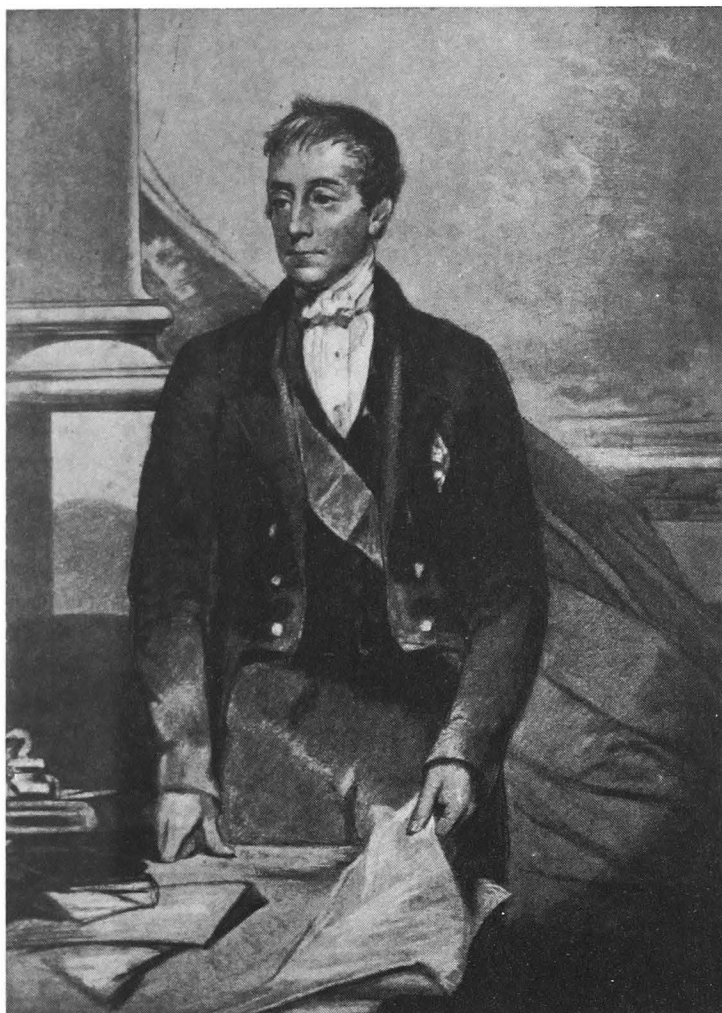
GEORGE EDEN, EARL OF AUCKLAND From a chalk drawing in the possession of the family