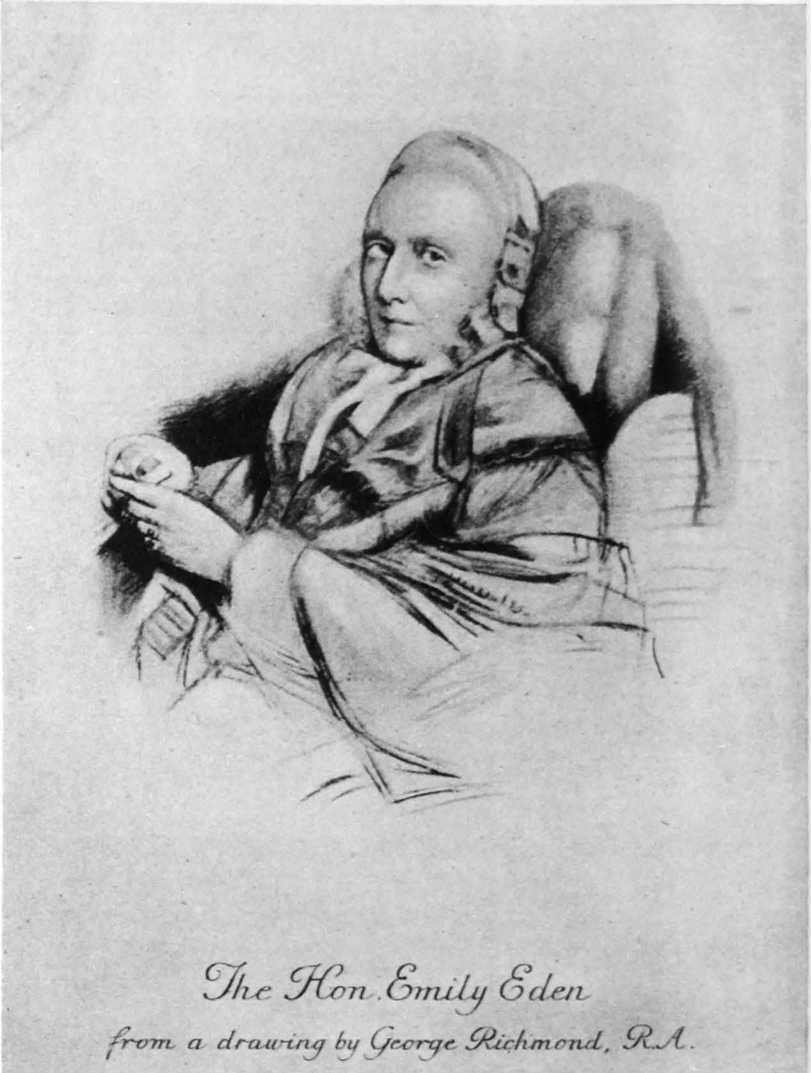
The Hon. Emily Eden from a drawing by George Richmond, R.A.

(By permission of Messrs. Macmillan & Co., Ltd.)