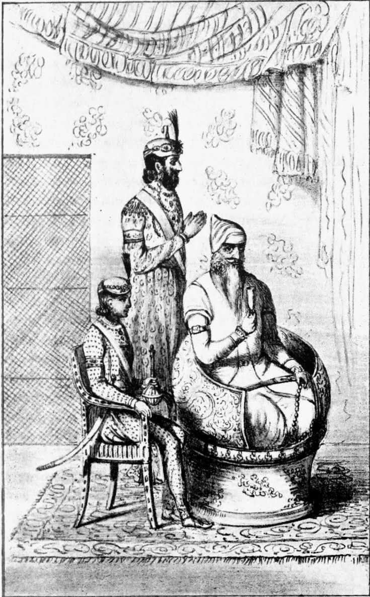
MAHARAJA RANJIT SINGH