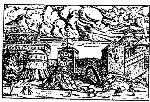
Siege of Acre From Münster's "Cosmographia," 1550.