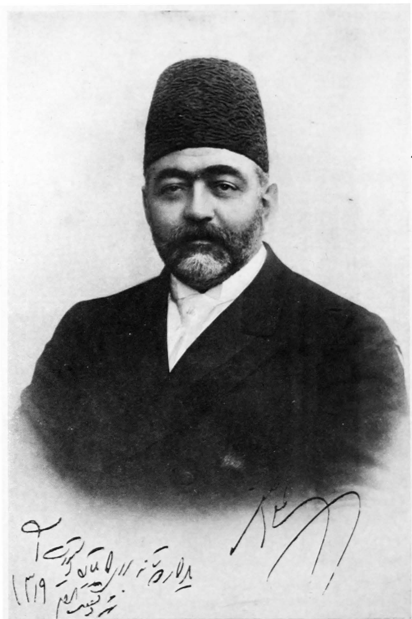
H. H. ATABAK-AZAM, THE GRAND VIZIER OF PERSIA