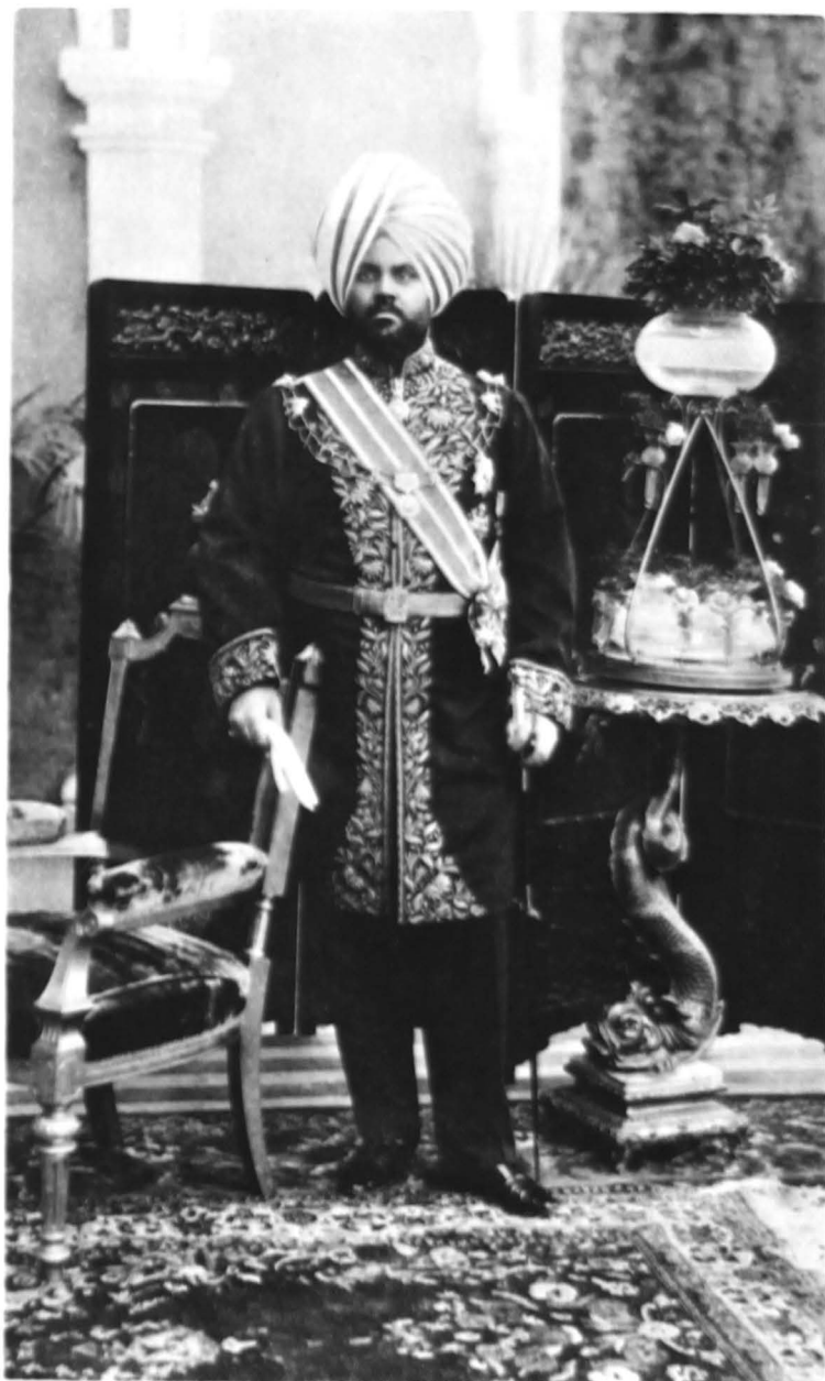
Allen & Co. Jr.