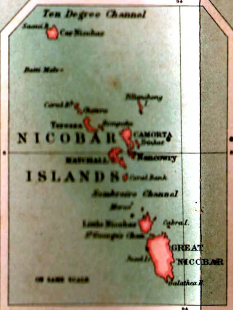
English Mile of Nicobar